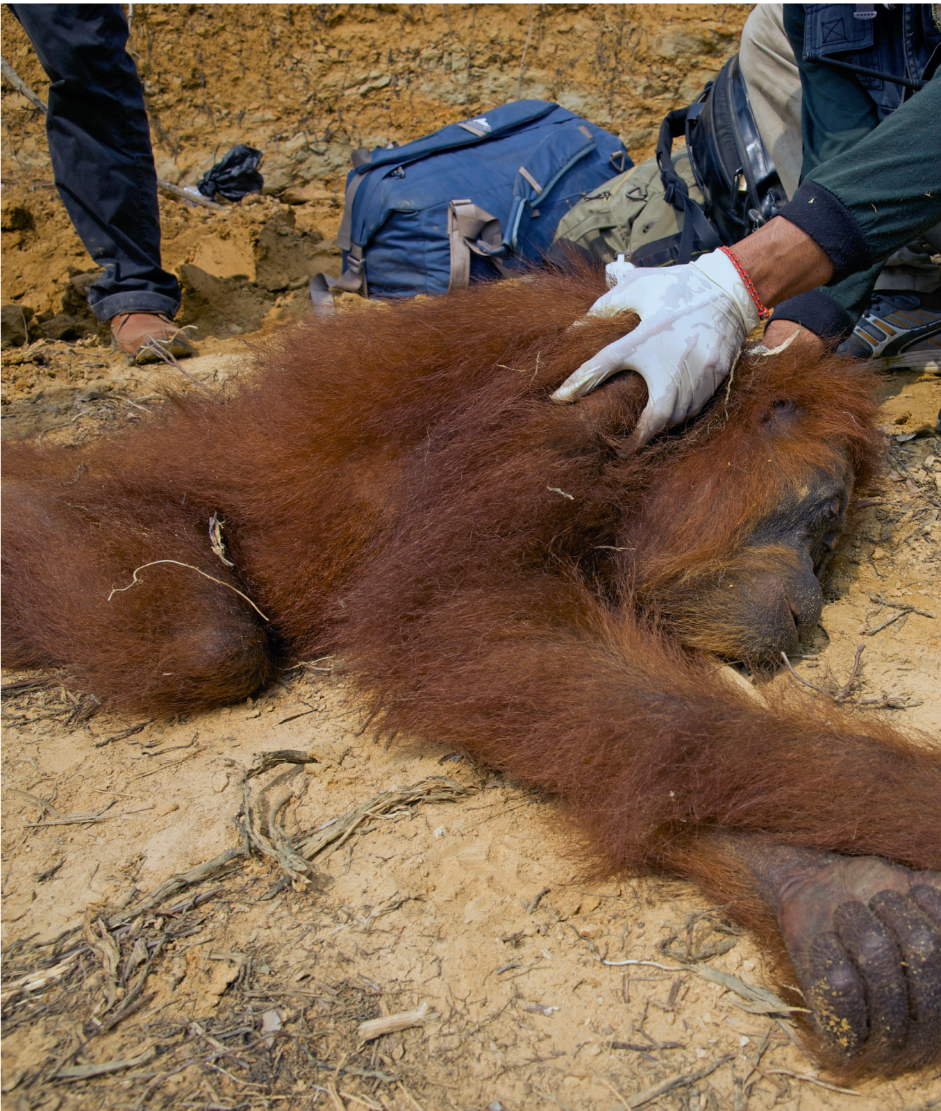
Photo: Natural and anthropogenic hazards imperil the survival of apes, especially if multiple threats affect already reduced and fragmented ape populations.