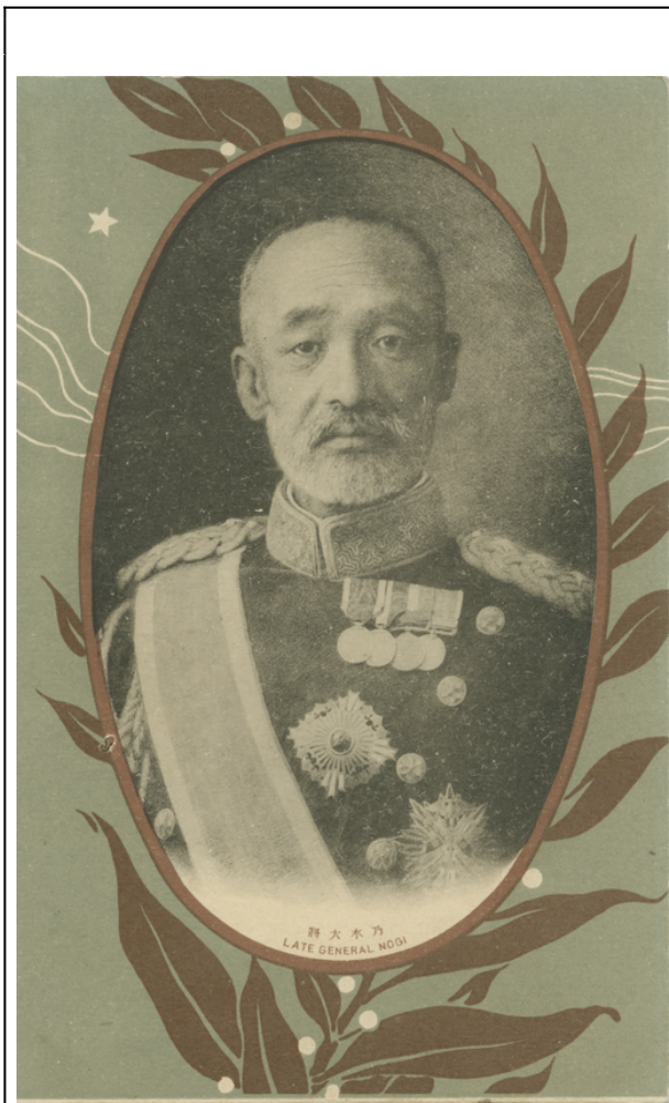
"Late General Nogi," Picture Postcard

of loyalty and sacrifice soon drowned out critical commentary. To justify the profligate waste of life at the core of Nogi's tactics in assaulting the heavily fortified Port Arthur during the Russo-Japanese War, which, at the cost of 15,390 soldiers, was the second most lethal battle of this conflict, the Japanese military further trumpeted "willingness to die" and "service to the nation" as important hallmarks of a glorious military tradition. 34