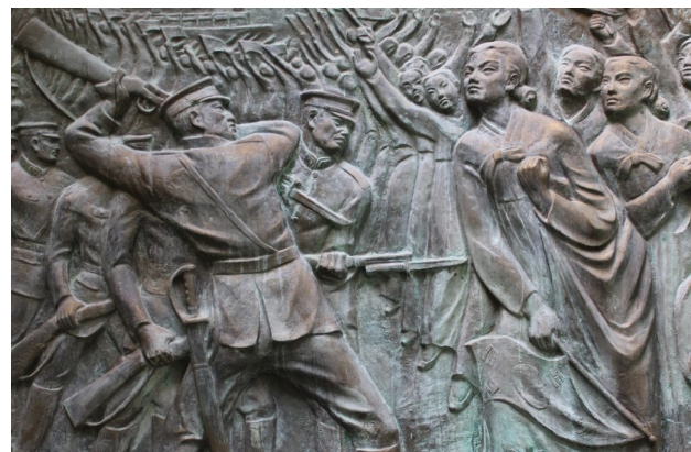
Bronze reliefs (details) depicting the Japanese response to Korean protestors

Meanwhile, in Taishō (1912-1926) Japan, the Sam-il Movement prompted many Japanese to scrutinize Korea's place in the empire for the first time since the 1910 annexation. As polarized opinions about the empire's actions in