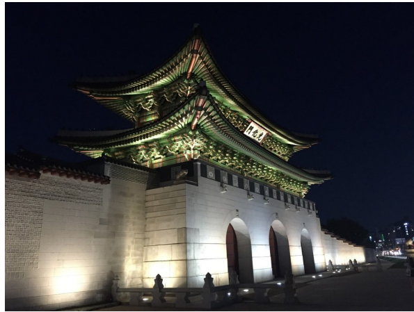
The reconstructed Kwanghwamun Gate, Seoul

be destroyed in the Korean War (1950–1953). 52