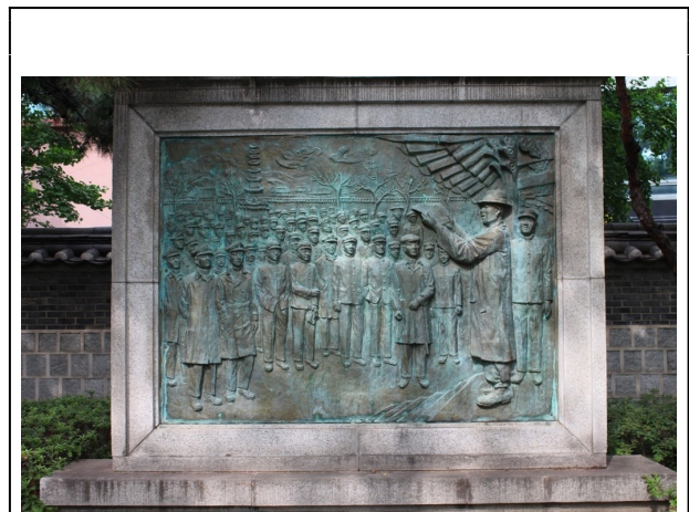
Bronze relief in T’apkol Park depicting the public reading of the Declaration of Independence on 1 March, 1919, Seoul

Approximately 3,000 copies of the declaration were distributed throughout Seoul that morning. In response, tens of thousands of Korean citizens from all walks of life poured into the streets waving the Korean flag, singing the national anthem, and shouting Taehan Tongnip Mansei (Long live Korean independence)! At two o’clock, the protestors gathered at T’apkol Kongwŏn (T’apkol Park, formerly Pagoda Park) to hear the declaration read publicly by the independence activist Son Pyŏng-hŭi 孫秉熙 (1861 - 1922). 23 It advocated non-violent demonstrations that would appeal to the international community for assistance in Korea’s bid to reclaim its freedom. 24