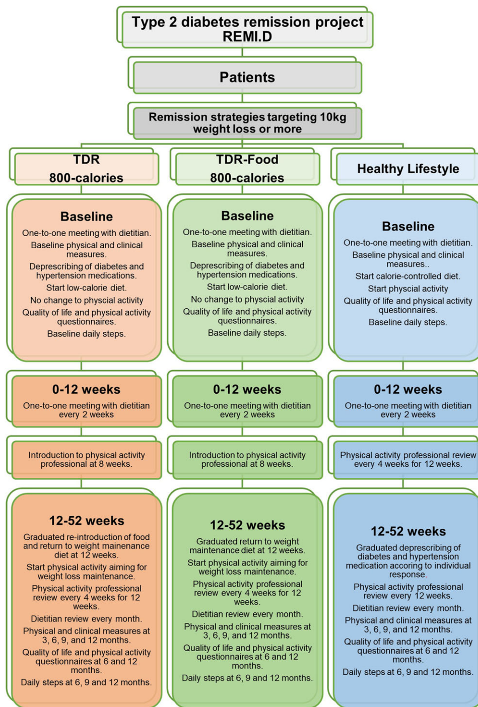
Fig. 1. Type 2 diabetes remission strategies, including the three interview groups, for this qualitative research.

inconsistencies not readily resolved by joint review (RCB, AH, and HJM) were referred to team member (AAL). Case classifications (attributes) were added including gender, age, index of multiple deprivation (IMD), weight lost at 12 weeks, HbA1c at 12 weeks, and diet option chosen. Codes were explored by running coding queries within NVivo 12. For example, one query sought to explore patient views coded to the TDF 'behaviour regulation' domain in patients who chose the diet option 'TDR-Formula Food Products' and achieved an 'HbA1c less than 48' at the end of the 12-week intervention. The creation of an analytical framework steered the application of coding query reports and refinement of data. (30) The patient