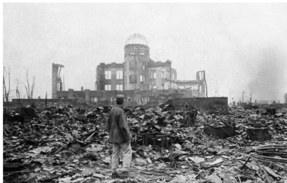
A man stands in a sea of rubble before the shell of a building in Hiroshima on September 8, 1945.