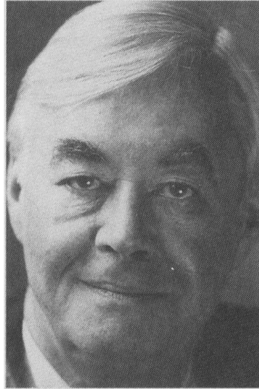
Sen. Daniel Patrick Moynihan

Lee H. Hamilton, director of the Woodrow Wilson International Center for Scholars will deliver the Pi Sigma Alpha Lecture on Thursday, August 31, at 5:30 p.m. at APSA's Annual Meeting in Washington, DC.