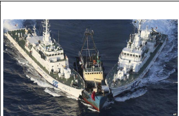
Activists from Japan, China and Taiwan have attempted to sail to the Senkaku/Diaoyutai Islands

This process, which circumvented the formal constitutional amendment procedure, as well as the substance of the "reinterpretation" and subsequent legislation, has been condemned within Japan as being unconstitutional – by constitutional scholars, former Directors of the Cabinet Legislation Bureau, a former Supreme Court Judge, and tens of thousands of protesters in the street (for more on this, see this essay in JURIST ). But leaving those issues aside, several of the changes also raise international law issues, which have been subject to far less scrutiny within Japan, and have gone virtually unnoticed outside of Japan.