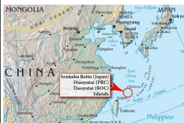
Japan, the People's Republic of China and the Republic of China all claim the Senkaku/Diaoyutai/Tiaoyutai Islands

The war-renouncing provision of the Constitution ensured compliance with the jus ad bellum regime, and indeed Japan has not engaged in a use of force since World War II ( jus ad bellum is the regime of international law that governs the use of force – it essentially prohibits all use of force against other states, with two exceptions, namely the exercise of the right of individual or collective self-defense, and collective security operations authorized by the U.N. Security Council). But with the purported "reinterpretation" and revised laws – which the Prime Minister has said would permit Japan to engage in minesweeping in the Straits of Hormuz or use force to defend disputed islands from foreign "infringements" – Japan has an unstable and ambiguous new domestic law regime that could potentially authorize action that would violate international law.