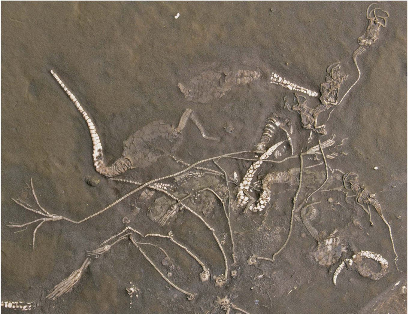
Figure 2. At least ten complete juvenile specimens of Ectenocrinus simplex (Hall, 1847) attached to a hardground within the Upper Ordovician Neuville Formation near Québec City in Canada. Jim found that lengthening of the stem follows a logistic pattern, with relatively slow growth in the youngest crinoids, a “middle aged” growth spurt during which stem length increases extremely rapidly, then comparatively slow growth in the adult phase. This growth sequence offers a general model that can be extrapolated to other stalked crinoids in which complete specimens are known but growth sequences are not available. Reconstruction of stem lengths allows for study of how progressively larger and older individuals can position their calices further above the seafloor. This suggests partitioning of space and food resources, a finding augmented also by Jim’s work on food-groove widths and tube-foot spacing (e.g., Brower, 2011) (text paraphrased from Jim’s contribution to the Dept. of Earth Sciences Alumni Newsletter from 2017).

focused on how morphology of crinoid feeding structures scaled with body size through ontogeny, hypothesizing that the relationship should be governed by an energy balance between nutrients captured and metabolic requirements. The general theme of ontogenetic scaling of crinoid feeding was to remain a focus throughout his career, and his approach continued to evolve, ultimately resulting in models that combined morphological and environmental parameters within the paradigm of filtration theory (Brower, 2007). Characteristic of all these studies is the rich, exceptionally detailed morphometric data, the statistical rigor of analysis, and their grounding in sound biological and biomechanical principles (e.g., Brower, 1987).