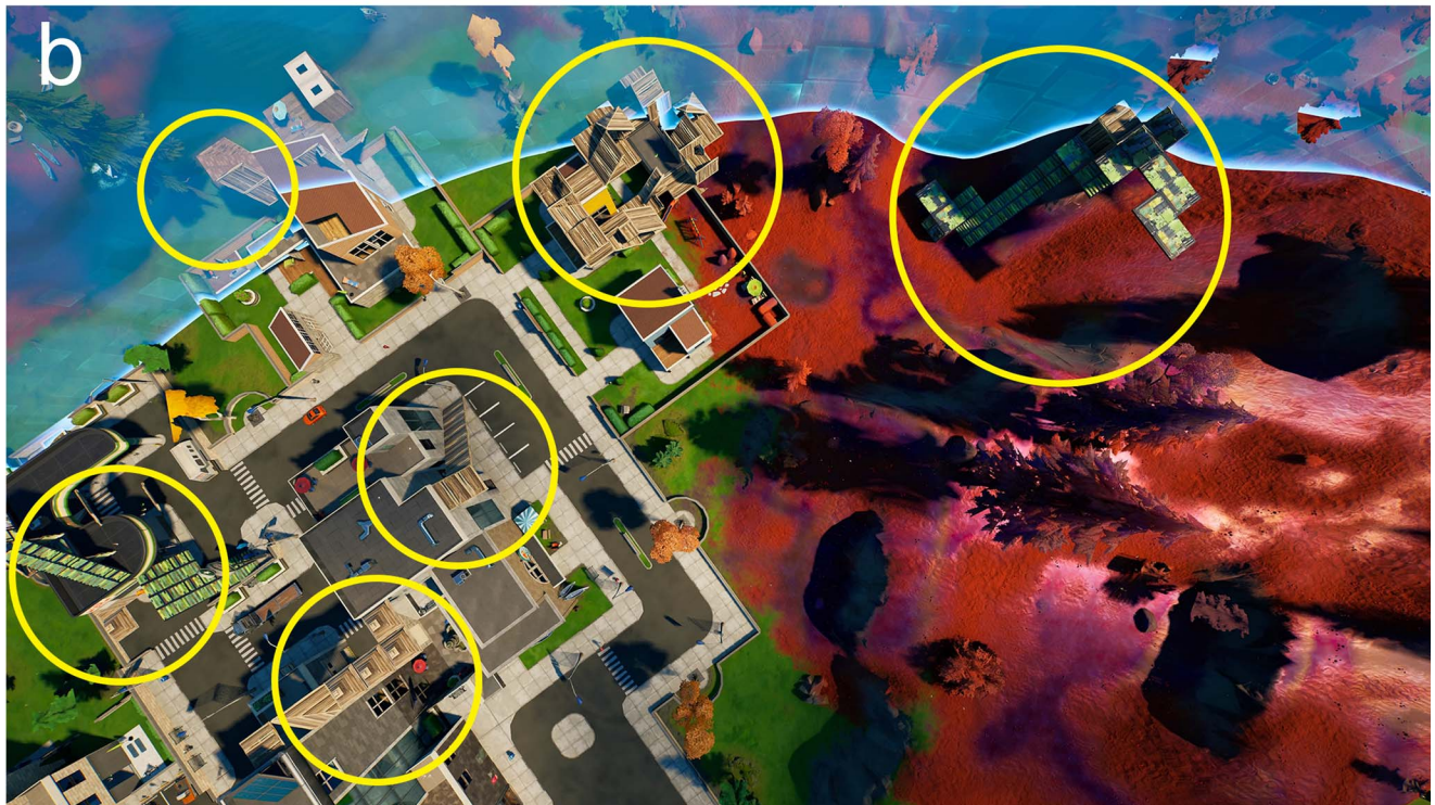
FIGURE 4. Examples of still images captured by airborne digital drones: (a) drone-captured image above a player-built base (circled in yellow) in No Man's Sky , part of the image set used to create a digital elevation model (DEM); (b) drone-captured image above a town featuring temporary player-built fortifications (circled in yellow) in Fortnite , part of the image set used to create a DEM.