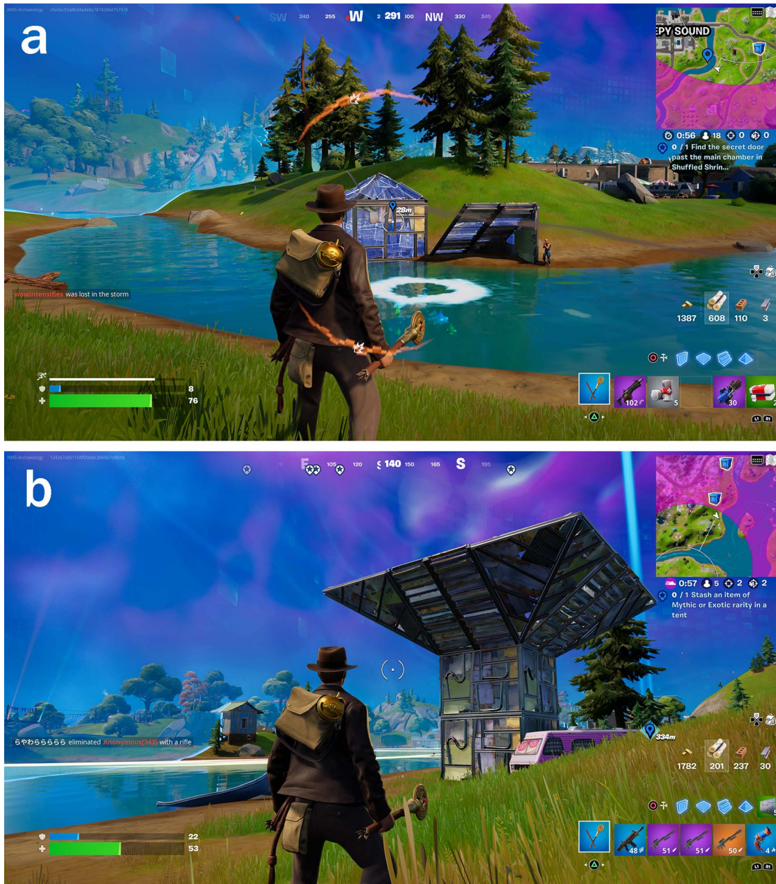
FIGURE 2. Examples of player-modified landscapes in Fortnite : (a) player-built fortification in Fortnite . Note the purpose-built “salt box” construction of the fortification (left) and the impromptu “lean-to” construction (right), with opposing player on the far right for scale; (b) player-activated, readymade “InstaFort,” which self-constructs when a player tosses its “seed” into the landscape. By chance, Chapter 3, Season 3 of Fortnite features a playable Indiana Jones avatar, pictured in the foreground.

landscapes: rapid and persistent. Fortnite (Epic Games, 2017) is a widely popular, free-to-play battle royal-style game that hosts groups of 100 players on a static island. 2 Constructions built by players on the island (Figure 2) last only for the duration of the battle—typically 20 minutes, or until a player destroys another’s fortifications (“rapid landscape”). No Man’s Sky (Hello Games, 2016) continues to be one of gaming’s most popular open world/space exploration games, and it concurrently hosts thousands of players gradually settling/colonizing a procedurally