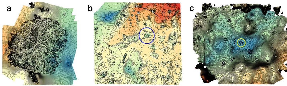
FIGURE 6. Examples of contour maps of digital landscapes rendered in QGIS: (a) contour map of Fortnite 's Battle Royale Island created in QGIS; (b) detail of a contour map created in QGIS of a Fortnite town with player fortification (circled in blue); (c) contour map created in QGIS of a player base (circled in yellow) in No Man's Sky .

preserve, and future-proof (Huggett 2020). Capturing individual instances of data, however, can be done, and it must be done at the source either at the time of creation or shortly thereafter lest they be lost, overwritten, or otherwise destroyed or forgotten. To document massive amounts of data, sampling seems to be a reasonable way forward. We can study the nature of a raging river by sampling it—buckets of evidence collected over time. So it is with the data stream.