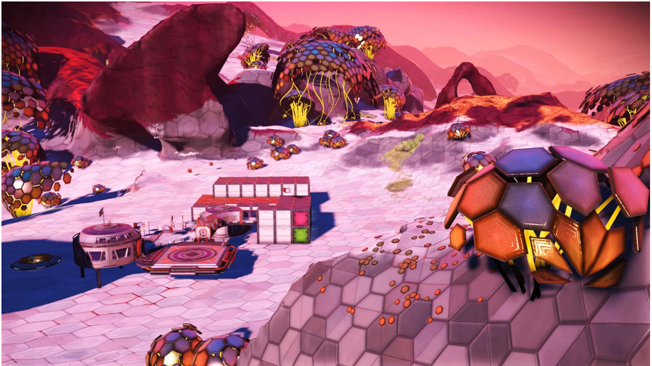
FIGURE 3. Player-built base in No Man's Sky .

Many contemporary video games and virtual worlds do contain various levels of procedurally generated content (PCG). One of the more common PCG tools used by developers of games and CGI animation is Perlin noise, a coded algorithm that creates varying instances of textures/animations to provide subtle variety that negates the need to hand code, for example, every leaf on every tree in a video game forest. Even if a game's landscape can be understood as "static," it likely contains PCG elements, but not to the degree of fully PCG games such as No Man's Sky or Valheim .