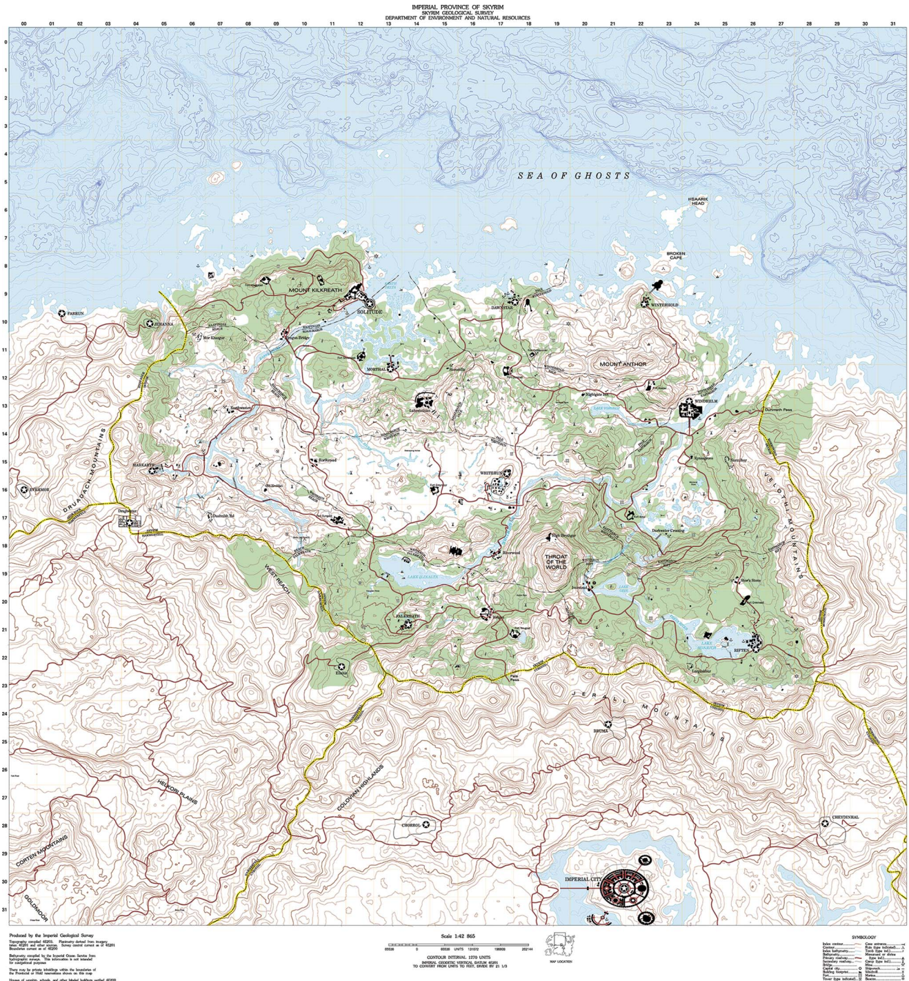
FIGURE 1. Timothy Cook’s topographic map of Skyrim derived from The Elder Scrolls V: Skyrim . Image CC0. Source: https://www.nexusmods.com/skyrim/mods/36159 .

“procedurally generated” landscape (i.e., a never-before-seen space that is generated by an algorithm). The games also needed to be multiplayer in order to capture evidence of community (or isolation from a wider community). In addition, the games needed to provide human players with raw materials and opportunities to build things (e.g., houses, towers, fortifications, etc.) as part of