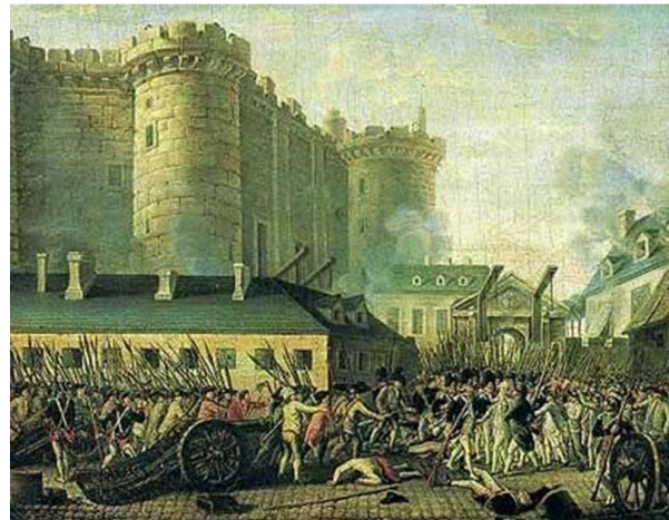
Attacking the Bastille

A: I recalled the diary of Louis XVI during the French Revolution. On the day a mob attacked the Bastille, the king wrote in his diary that nothing happened. Because he went hunting almost daily, the entry meant that he didn't catch anything. There was no recognition that society was being shaken from its very roots.