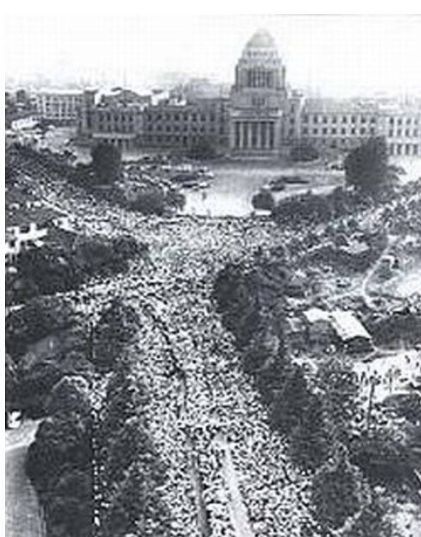
Protesters surround the Diet in 1960 Ampo demonstration

Q: But aren't politicians taking these protests lightly?