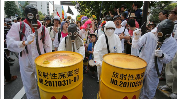
Anti-nuclear protesters, wearing gas-masks, beat metal drums as they march near Japan's Parliament in Tokyo on July 29.

In a series of editorials in the Asahi, Oguma addressed readers more directly. On March 9, 2012, he exhorted his readers to “think for themselves” in deciding whether nuclear power is appropriate for Japan, pointing out the importance of an informed citizenry and the possibility of protest as a viable and even necessary tool of social change, albeit, one that requires more of each individual than they are used to giving. On May 9, 2012, he points to the impossibly high economic and social costs required to somehow minimize or even manage the risk that nuclear power poses to society and humanity. Oguma points to the need for “courage” in facing up to entrenched interests of banks and insurance companies, corporations and bureaucrats, in a Japanese state that is still authoritarian, even in dysfunction.