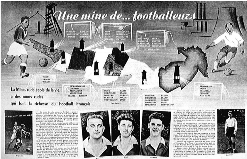
Figure 1. “Une mine de... footballeurs”. Douai Mines, April 1955.

This connection was an effect not only of the company’s advertising strategy, which sought to highlight the overall importance of the coalfield for France. From the 1950s onwards especially, children of Polish migrants were indeed very present in professional and non-professional football clubs. Some of them, like Kopa, Wisniewski, and Budzinski even played in the French national team. Today, this type of player is collectively remembered as a symbol (or myth) of the integrative power of football, both as a medium and as a reflection of the integration of immigrants into the French Republic. 3 This idea is also present in local collective memory. In the northern coalmining area, football is thought to have helped erase the differences between natives and migrants and to have helped in building a homogeneous class identity. This point is most often highlighted in the case of Polish migrants, who comprised a large part of the mining workforce in northern France. Indeed, a recent historical overview claimed that “Football in coalmining was an ideal place to closely integrate boys who had different origins and backgrounds. It was a way to provide social promotion.” 4