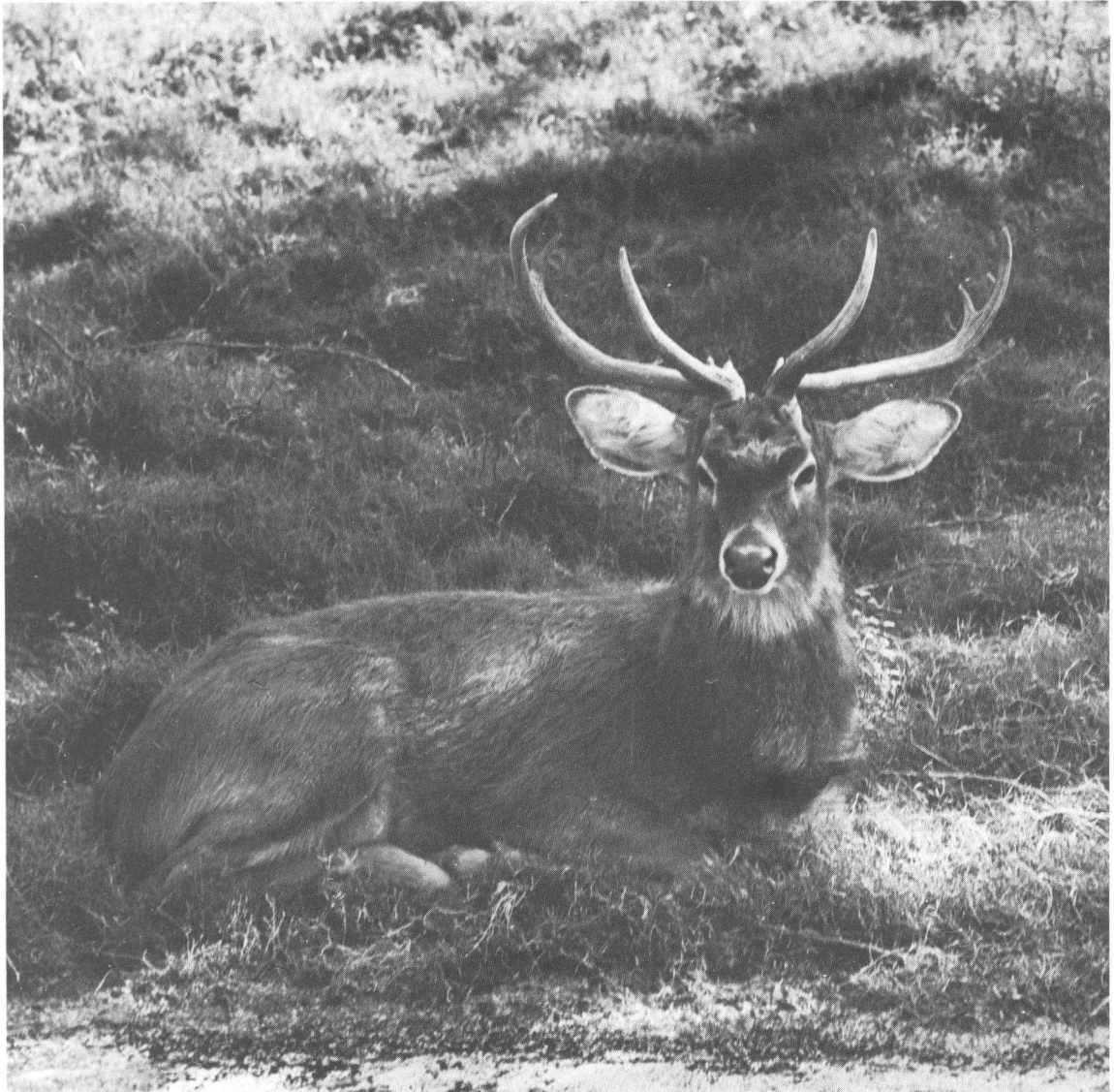
Brow-antlered deer in Delhi Zoo, India.

hence, we are unable to offer a defensible country-wide population estimate. However, we did conduct population surveys in Kyatthin WS as a component of a draft management plan, and the resultant data provide a starting point for assessing population size. The survey was conducted during 30 March–5 April 1983 and consisted of ground-based counts of deer along straight-line transects located at 1.5-km intervals across the southern half of the sanctuary. The Brow-antlered deer in Burma