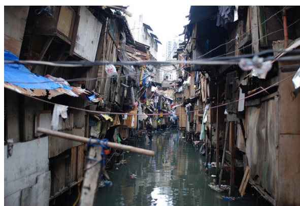
Figure 3. Marginal urban enclave of Siteo Baseco, Tondo.

struggled to cope with its consequences. But the government-sponsored promotion of the remarkable transformation of the city, from a previously alarming and deteriorating place to a vibrant, expanding metropole proved a cruel illusion—a false dream—for the tens of thousands of squatters confronting the problem of a lack of housing and related health impacts, in one of the third world's fastest growing cities. Most of the comfortably-housed wealthy locals and foreign visitors rarely went anywhere near the burgeoning slum quarters of the city. But Makati's tree-lined avenues and glass-lined skyscrapers cast shadows across the makeshift houses of squatters from rural areas living at overcrowded addresses that did not appear in information provided on recommended tours and general guide maps. The migrants from the provinces threatened with homelessness dwelled out of sight of the path of the capital's crushing progress, but they lived within its interstices and in vulnerable areas; low-lying neighbourhoods often sited directly in the path of typhoons and prone to flooding.