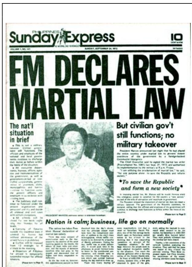
Figure 2. Sunday Express front page after Marcos declared martial law (September 1972).

In Manila, migrants were largely absorbed into