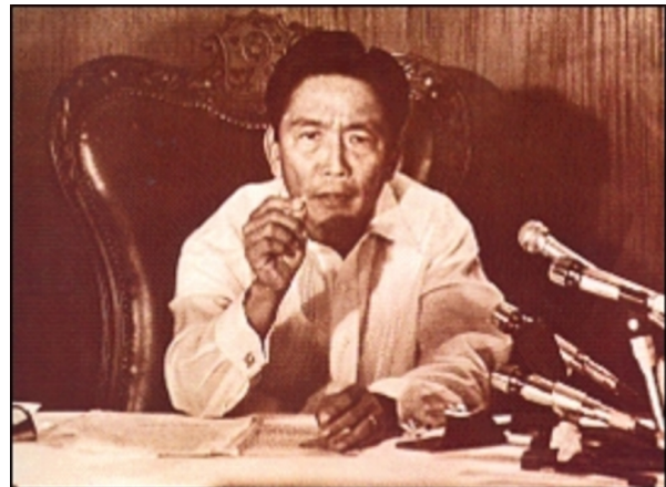
Figure 1. Famous photograph of the late Philippine President Marcos declaring martial law (21 September 1972).

uncertainty, the threat of rebellion in the countryside and possible succession in Mindanao. Marcos launched a radical new social agenda under the provisions of martial law. He established new government structures and agencies, abolished others previously responsible for planning and execution of economic functions, and implemented a revolutionary social welfare programme aimed at restructuring society. In 1972, he also introduced a strategy of balanced economic growth and a genuine agrarian reform programme. His 'new society' was to be based on an innovative system of government that would respond to the needs of ordinary people, which he called 'constitutional authoritarianism'. 5