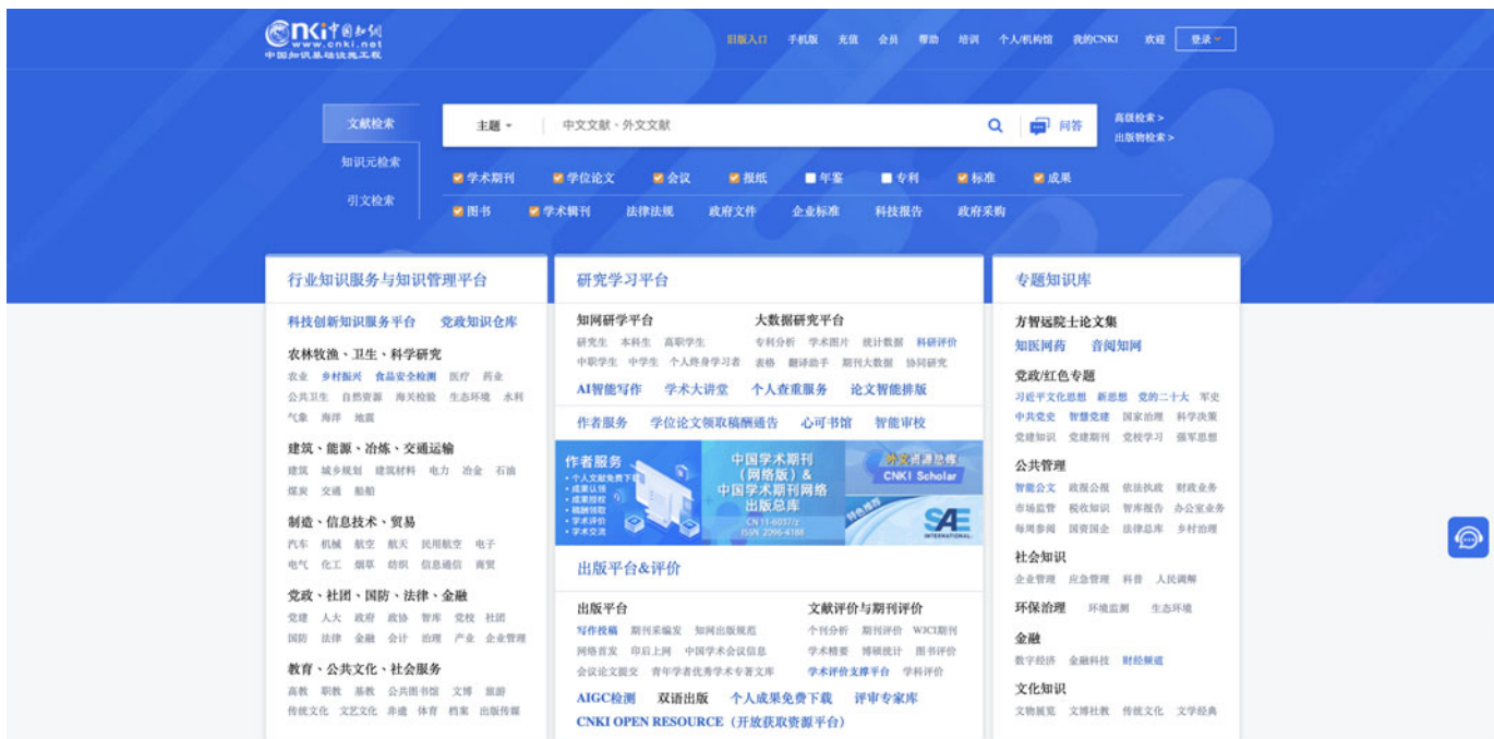
Fig. 1 Interface of CNKI (within mainland China)