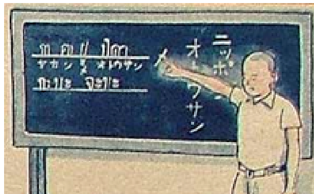
[Behind teacher's arm:] Japan, father

Let's make the culture of Greater East Asia flourish more and more. In order that the peoples of Greater East Asia can communicate with each other, let's learn Japanese.