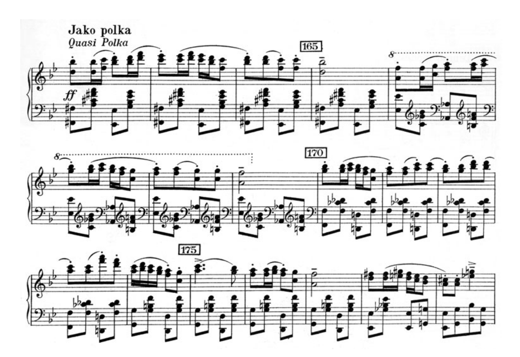
Example 3. Schwanda, Act II, bb. 162–79. Copyright © 1929 (Renewed) by Associated Music Publishers, Inc. International Copyright Secured. All Rights Reserved. Used by Permission.

Of all dance forms in Schwanda , the polka is the most prominent. It appears for the first time in Act I, bb. 1270–359. While it may recall the polka from Prodaná nevěsta , it is far more elaborate harmonically. Beginning at bar 1302, Weinberger uses extended tonality with several chromatic sections (notably bb. 1302–10) to break out of the established B major key. <sup>60</sup> When the polka appears a second time, this time 'played' by the Devil in Act II (bb. 144–91), it comes with highly dissonant harmonies as the most overt polytonal passage in the opera to make it integral to the dramaturgy: when Švanda refuses to play for the Devil, the latter takes up the bagpipes himself and plays a truly devilish piece in hell (Example 3). The harmonies recede to tonal configurations when Babinský defeats the Devil in their card game (Act II, b. 1061), celebrating with polka motifs that lead to the famous fugue, which concludes this first scene of Act II. And a last time, Švanda's polka appears – albeit in a radically modified form – as the basis of the entr'acte (Act II, from bar 1551), which leads into the final scene.