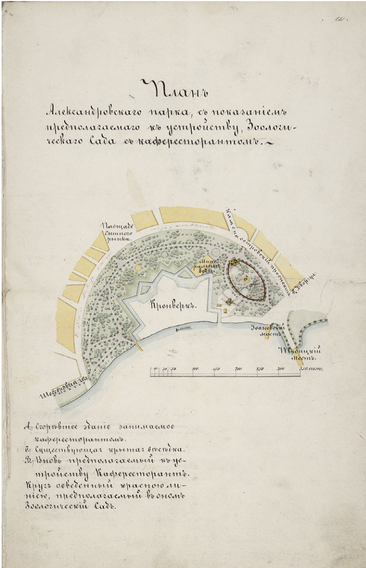
Figure 1. Map of Alexander Park indicating the place of the future zoo, which was submitted by Julius Gebhardt to the general governor of St Petersburg in November 1864.

zoo into the urban fabric, the governor general of St Petersburg, who apparently approved the idea, had to obtain the agreement of the minister of transport, Pavel Melnikov, who, in turn, had to secure an amendment of the emperor's decree.