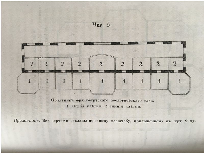
Figure 3. Plan of a building for eagles in the Frankfurt zoo made by Vasilii Radakov during his trip around Western Europe in 1860.

vicinity. The idea of the Moscow zoologists was to find a middle ground between these two extremes by presenting a limited number of both exotic and domestic animals and plants. On the one hand, the organizers hoped that their garden would become a significant landmark for the inhabitants of Moscow, including, importantly, common people, since as they could attest, blue-collar workers ( bluzniki ) willingly visited Western European zoological gardens. 58 On the other hand, they also hoped that the zoo would become an important international scholarly institution and a centre of animal exchange between local and Western European zoologists. 59