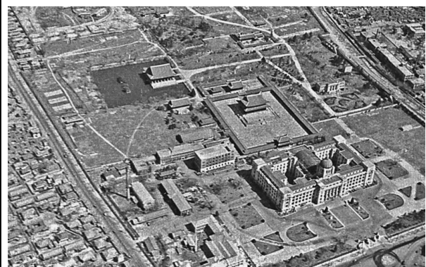
Figure 6.1 Former Japanese Government-General Building. 1954 from Ministry of

Although the Main Hall was among those structures that were preserved, it now found itself overshadowed by the five-storey, stone-built GGB. The colonial government later further encroached on the palace site by building the Japanese governor-general’s residence behind the Main Hall in 1939. As a result, the Main Hall was sandwiched between two modern-style Japanese buildings. These sites were believed to be especially ‘auspicious’, located along the ‘geomantic vein of vital energy’. When the two buildings were deliberately built in front of and behind the Main Hall, they seemed to signify the bleak future of Korea in geomantic terms: ‘the Korean palace was now starved of vital energy’ and its ‘geomantic fortune was all in the hands of the Japanese’ (Yoon 2006: 292). The ensuing city plan of the colonial government was an exercise in iconographic politics aimed at further distorting the geomantic balance between the city and nature by erecting a Shinto shrine at the southern end of the north-south axis. The north-south axis was soon developed as a main road, leading directly to the Japanese military base in Yongsan, beyond the city’s South Gate (Chung 1994: 52–54).