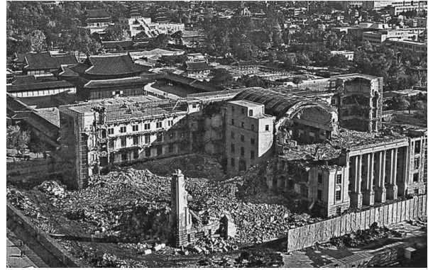
Figure 6.3 Demolition of former Japanese Government-General Building from Ministry of Culture and Sports, Koo Chosŏn chongdokbu gŏnmul (former Government-General Building in Korea) (Seoul: Ministry of Culture and Sport 1997).

The actual dismantling of the GGB began on the 50th anniversary of the Liberation Day on 15 August 1995. A grand national ceremony was broadcast throughout the country. Accompanied by fireworks, dances, and cheers, the highlight of the ceremony being the tearing off of the steeple on the top of the dome of the GGB. The decapitated steeple was exhibited at the site for a while and later moved to the Independence Hall of Korea, near Seoul. 11 A series of events to commemorate certain historical days or to celebrate festivals to revitalize national spirit was held at the site during the dismantling process (Ministry of Culture-Sports 1997: 356–357). The demolition of the GGB, however, had to be delayed by about a year due to litigation on the part of some citizens. In 1995 and 1996, civic groups opposed to the demolition of the GGB filed suits in the Seoul District Court, against the government and the Hyundai Construction Company, which was undertaking the actual work. However, the court rejected all these applications, affirming in its verdicts the need to revitalize ‘national spirit and energy’ by demolishing the GGB and restoring the Kyōngbok Palace (Ministry of Culture-Sports 1997: 366–370).