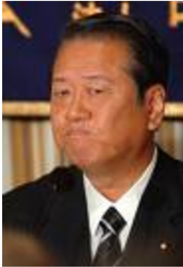
Minshuto Secretary-General Ozawa

Why? Because the Japanese bureaucratic system does not only have ancient built-in defenses, it has something akin to an immune system. We need to take a step back to see this in perspective. All countries have a concrete power system that is different from their theoretical one. All countries live with political honne and tatemae . The substantial system of power exists, as it were, inside the official political system that is described and regulated by such things as the constitution. The informal, unofficial, substantial system of power relations may change and drift farther away from what it should be in principle. The past decade of American political history provides a perfect example of that: power arrangements centered on the military-industrial complex and huge financial and insurance firms are stronger than the causes