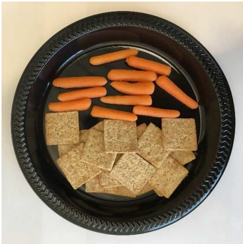
FIGURE 5: Food served in Study 2.