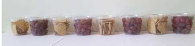
FIGURE 6: Choice Sets Used in Study 3.

After the child made a choice the experimenter recorded which container the child chose, and this served as our dependent variable. The child then completed several tasks, 7 received the chosen snack container as a gift, and returned to the classroom.