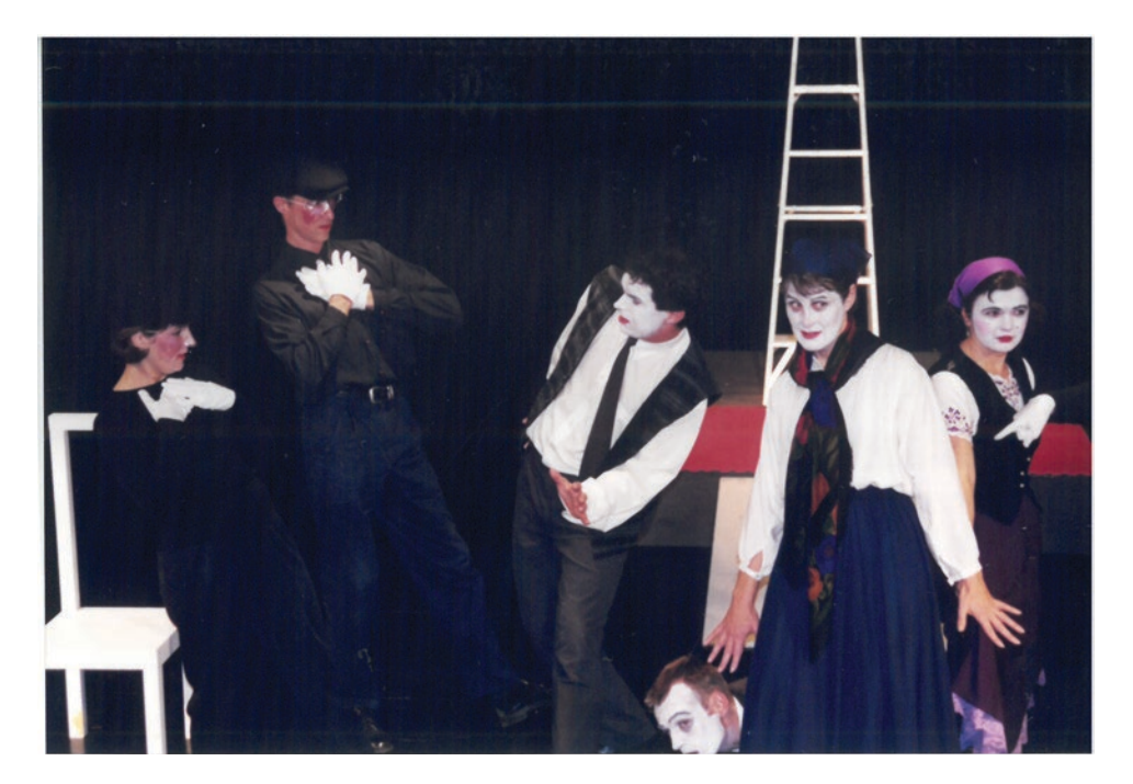
Figure 12. Steven Berkoff's version of Kafka's Metamorphosis. Phoenix Theatre, Taipei, 2000.

man-to-insect change is less disturbing—but that is the point. As poetry scholar Pauline Yu claims, "Natural object and human situation were believed literally to belong to the same class of events ( lei 類): it was not the poet who was creating or manufacturing links between them" (1987:11).