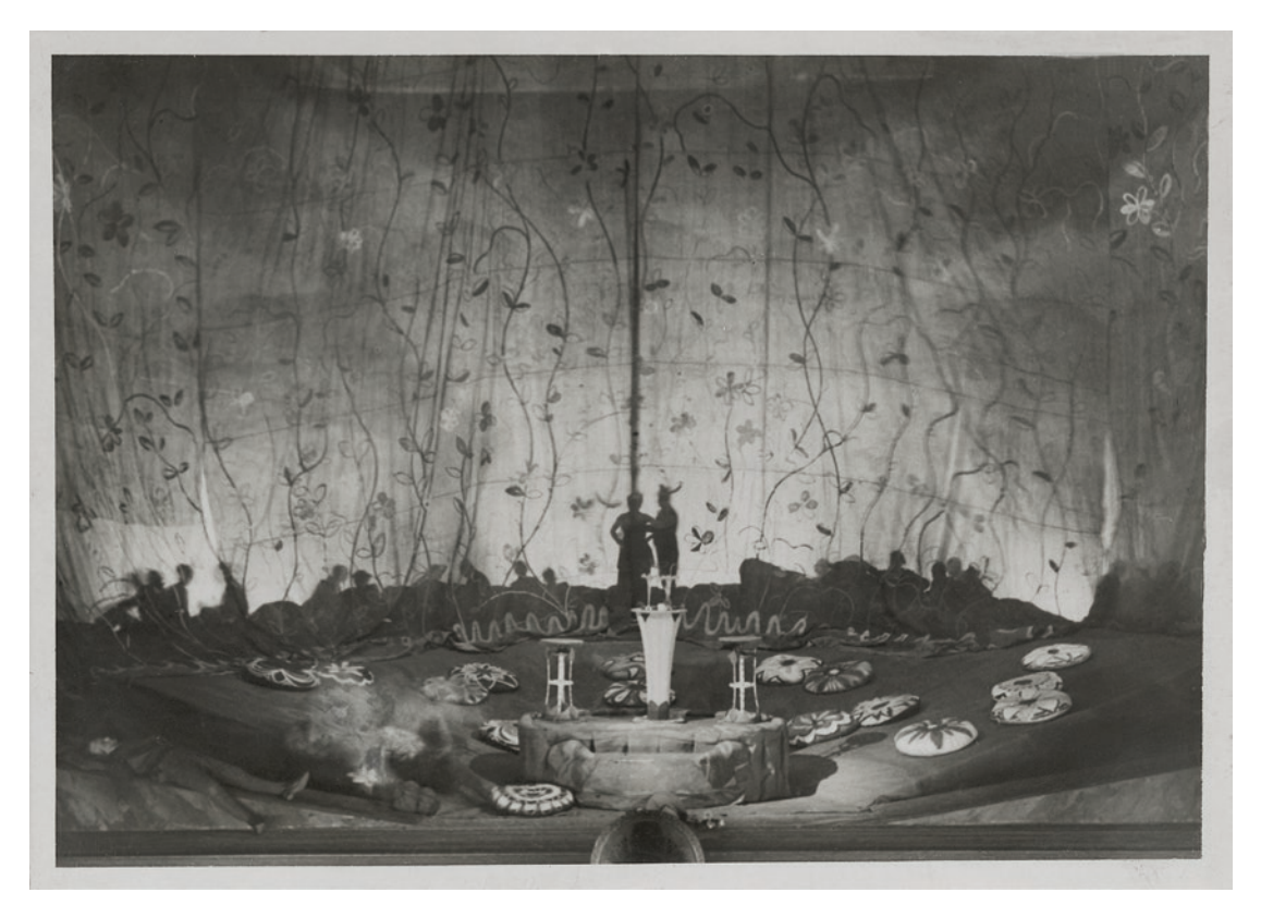
Figure 6. The set of a meadow for the butterflies in act I by Karel Hugo Hilar and Josef Čapek for the Prague premiere, 1922.

creation" and the Lepidopterist kills, pins, and labels his butterfly catch "for the love of nature." When the Tramp anthropomorphically says the butterflies flying around them are "happily playing," and the Lepidopterist insists they are merely engaged in sex; both views are shown to be partially correct in the following butterfly scene.