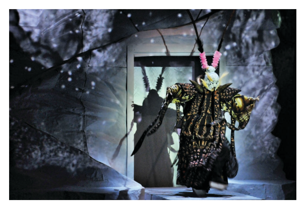
Figure 10. Wu Hsing-kuo's mythical bug in Tuibian is depicted by the costume more than by insect-like movement. National Theatre, Taipei, 2013.

Gregor is thrust into an alien umwelt to which he is unprepared and unable to adapt, is reconceived by Wu to reconcile a man becoming an insect as reflected in the Taoist Zhuangzi . In one anecdote, a man visiting a dying friend exclaims, "How marvelous the Creator is! What is he going to make out of you next? [...] Will he make you into a rat's liver? Will he make you into a bug's arm?" (Zhuangzi 2003:81). While the Greco-Roman world relished transformations, by which it animated the natural world with human consciousness, it rarely went to such an extreme of converting a person into a bug's arm, or indeed any insect. The weaver Arachne becoming a spider is the closest Ovid comes to insect transformation even though the Greeks had deities for both bees and ants. Aristotle named the butterfly "Psyche," and it has since symbolized Christ's rebirth and the Christian soul after death. All of Aristophanes's extant comedies include insect characters to satirize Athenian society with established associative traits easily recognized by his audience.