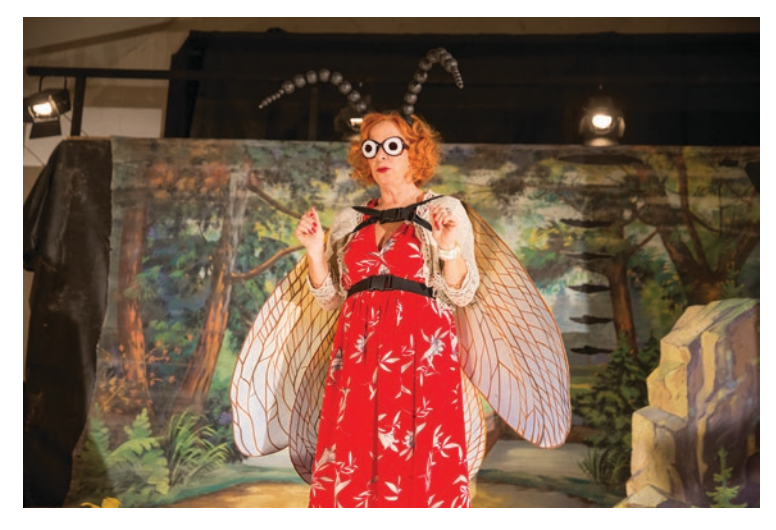
Figure 9. Mrs. Cricket watering her garden just before she is killed by the Sabre Wasp to feed his Larva in Jan Švankmajer's 2018 film, Insects.

simultaneously show layers of their other two roles. Combining horror film aesthetics with surreal transmutations, the movie documents the stage as the site where these actors fail to become insects through their inept dramatic skills and the Director's machinations. The insect-actor-human roles bleed into one another in the pursuit of revenge, lust, and gluttony. Once again, the human moral frame contains insect life, and the insect characters are reduced, each to a single recognizable attribute.