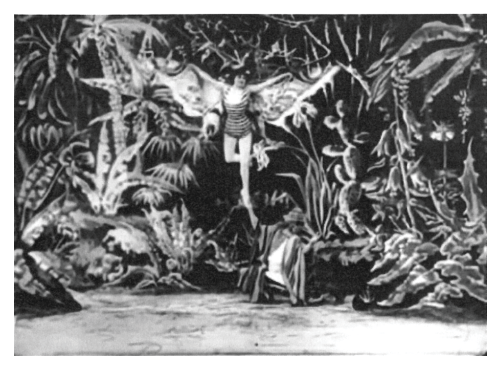
Figure 2. The Butterfly emerges from the cocoon in George Méliès's La Chrysalide et le Papillon d'or (The Brahmin and the Butterfly), 1901.

juvenile hormone disappears, signaling the larva to begin constructing its casing for the pupa and undergo its next transformation. Not only does metamorphosis completely alter the organism, but also the organism's umwelt , its particular perceptual relationship to the world defined by markers, significant to the animal equipped to perceive and react only to them.