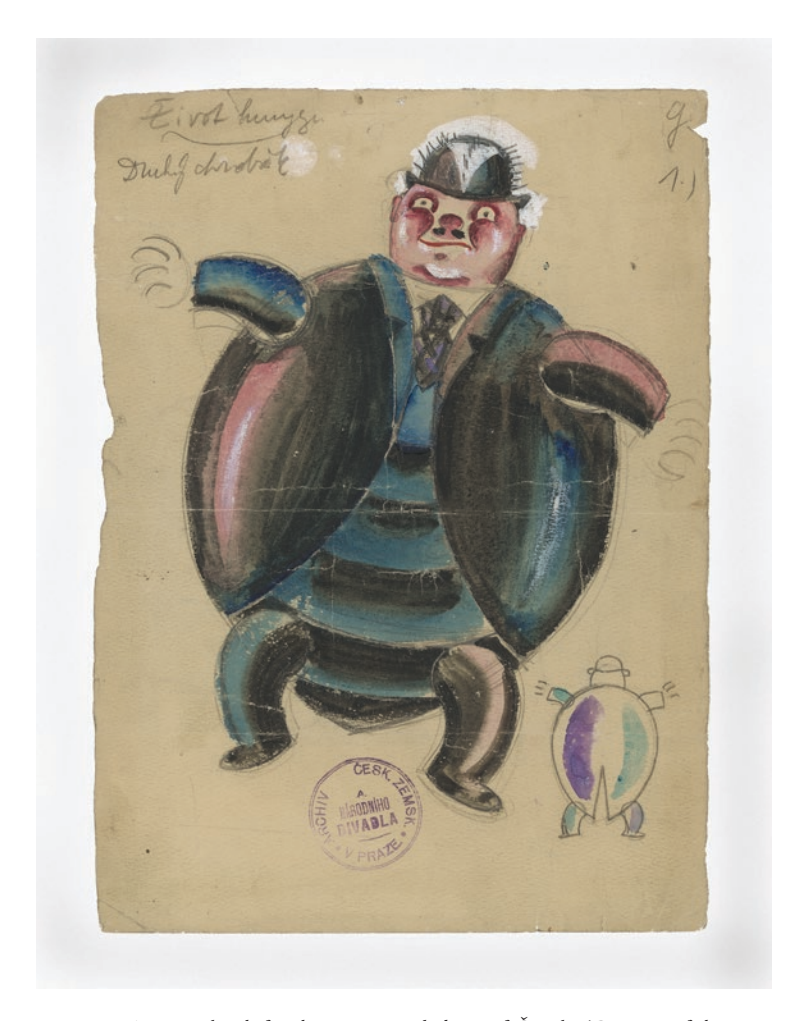
Figure 8. A 1921 sketch for the Dung Beetle by Josef Čapek.

connotation: insects are identified using genitalic dissection that only can be seen through a microscope on a pinned specimen since spreading out the wings and legs makes all features, even those not visible in a live insect, easier to see.