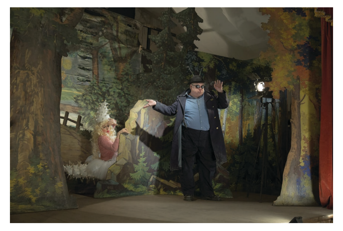
Figure 3. The Parasite dances with the ballerina playing the Larva before entering her burrow to consume her in Jan Svankmajer's 2018 film, Insects.