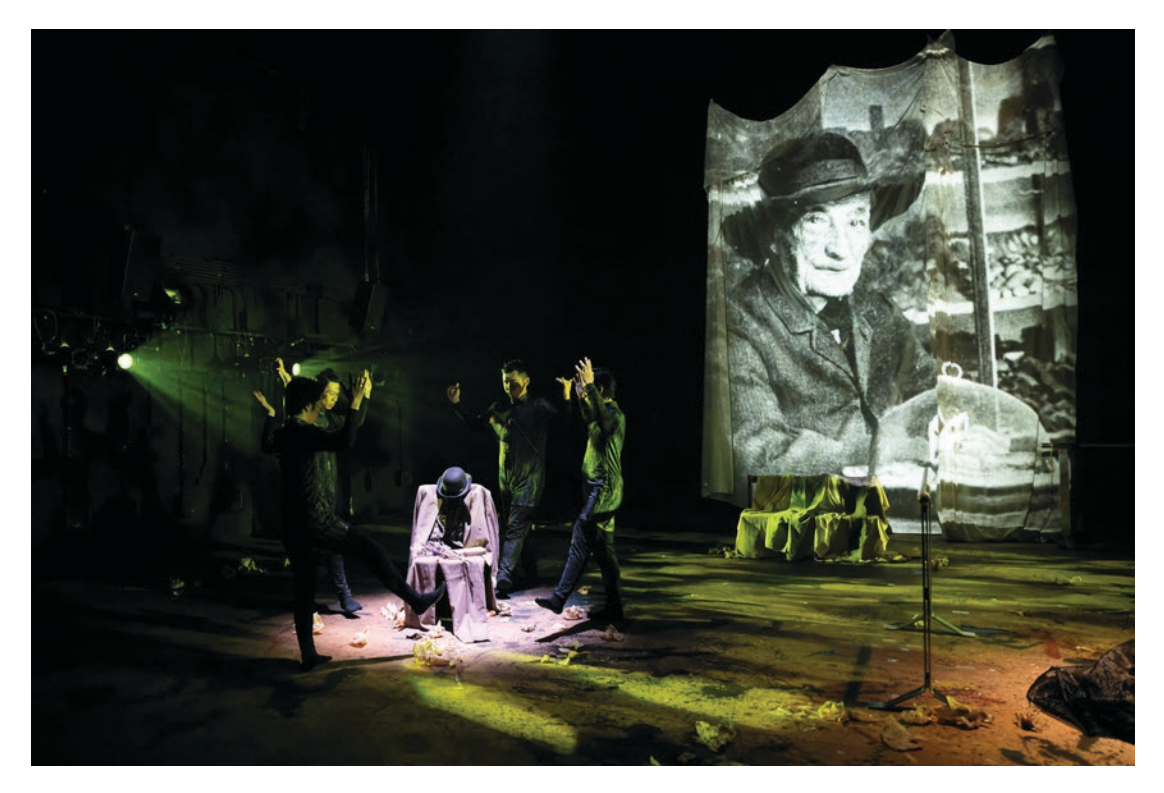
Figure 15. The Beetles invoke the spirit of Fabre at the beginning of Souvenirs Entomologiques: Playing Dead by Li Yi-chu. Experimental Theatre, Taipei, 2023.

entail investigations of insect life not only from recent discoveries in entomology, but also by revisiting ancient and indigenous cultural insights about the varied and complex processes that insects perform. Enacting the diversity of behaviors in an insect individual avoids resorting to a stereotype trait to represent it.