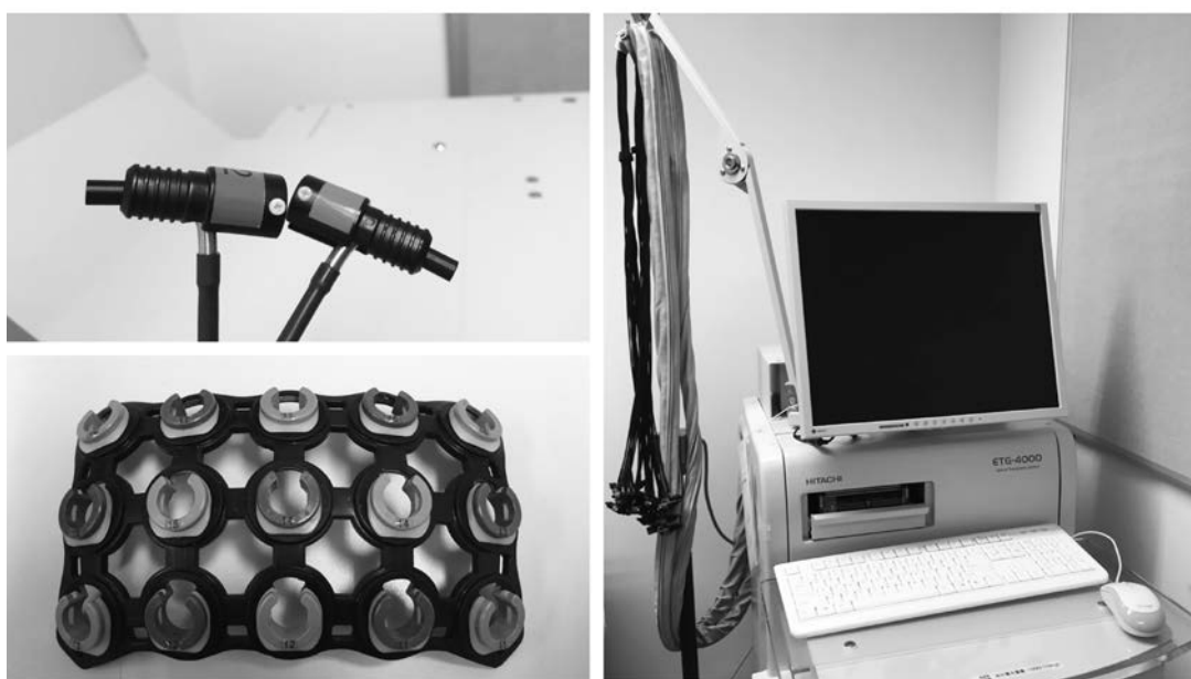
FIG 1 The components of a functional near-infrared spectroscopy (fNIRS) device: near-infrared light emitter/detector probes (upper-left), headgear to hold the probes (lower-left) and a computer unit with a signal processor (right).

Haemoglobin is a protein that forms an unstable and reversible bond to oxygen in red blood