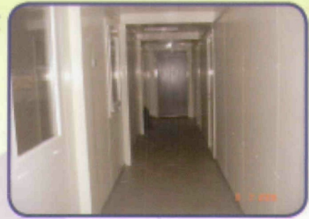
Inside MSF Hospital in Hattian Bala

Number One in the world within partly and turn key solutions incl. Transportation, Erection, Management, Training, Maintenance, Education, Administration, Storage, Out sourcing, Medivac, etc.