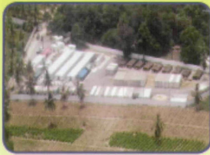
Thai Tsunami Victims Identification Centre