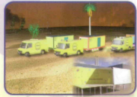
All kinds of Mobile Clinics