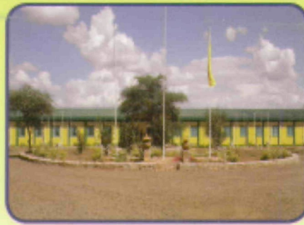
KATIKO Referral Hospital, Southern Sudan