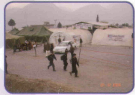
Cuban Hospital, Muzaffarabad, Pakistan