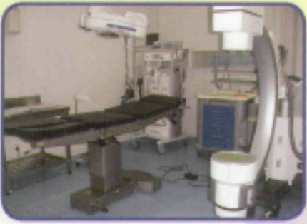
Inside OT in KATIKO Referral Hospital