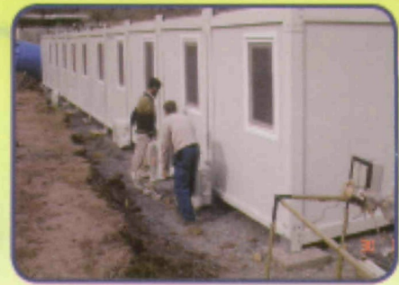
MSF Hospital, Hattian Bala, Pakistan