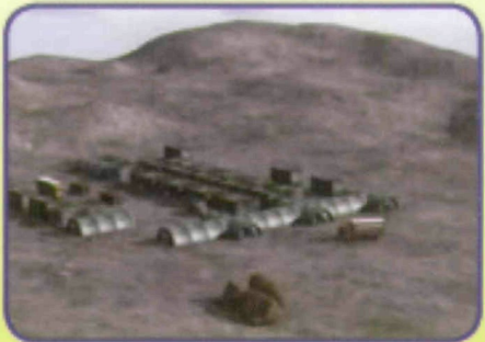
Norlense inflatable tents