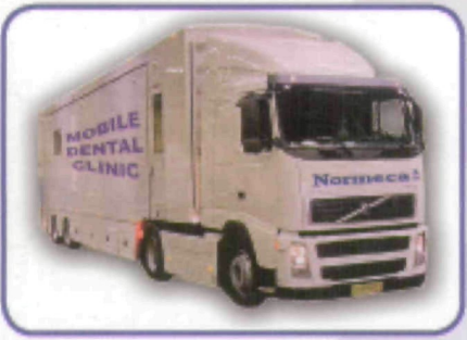
All kinds of clinics or hospitals in MultiSpace