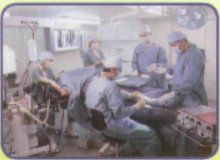
NorBase single and expandable containers