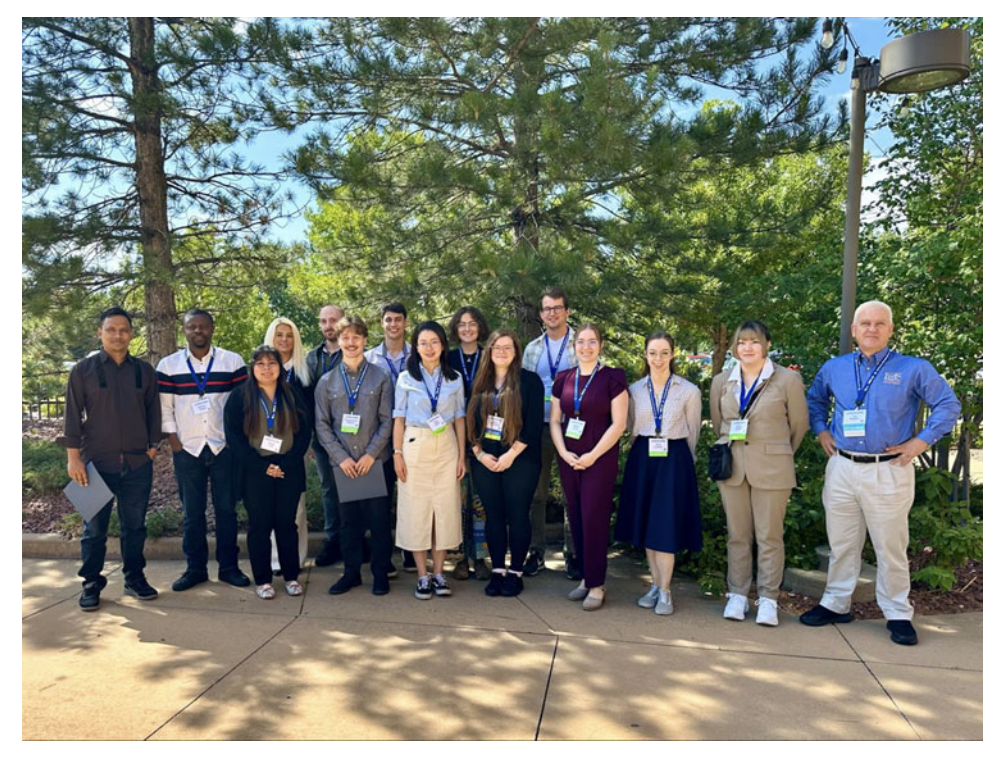
Figure 1. 2024 Robert L. Snyder student grant award winners.

Ultimately, the following presenters were named winners: