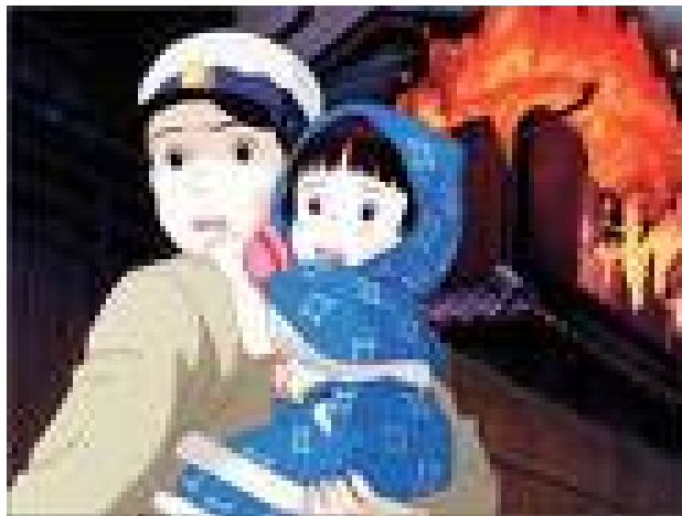
4. "Grave of the Fireflies" cartoon image of children fleeing the bombing

The government is indifferent to aiding war-distressed private citizens on the grounds that they were not government employees during the war. By contrast, in former West Germany, those wounded in air raids as well as relatives of those killed in air raids -- military personnel and private citizens alike -- became eligible for pensions under a 1950 law. Beginning in 1952, material damage to homes and household effects lost in air raids was covered by government compensation. In Britain and France, pensions and lump-sum payments were given to war-affected private citizens.