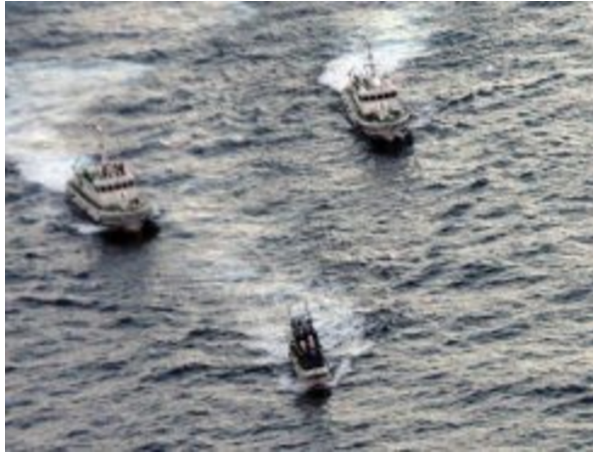
Two Japanese Coast Guard boats pursue a Chinese trawler

Qixiong and the provocative assertion that his case would be adjudicated under Japanese domestic law, rather than resolved through quiet diplomacy between Tokyo and Beijing.