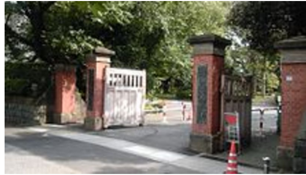
Fig. 9 - Entrance to Gakushūin

socialist” following his return to Japan. Yet, even if this were true, how might it help to explain a possible sympathy for the Nazis?