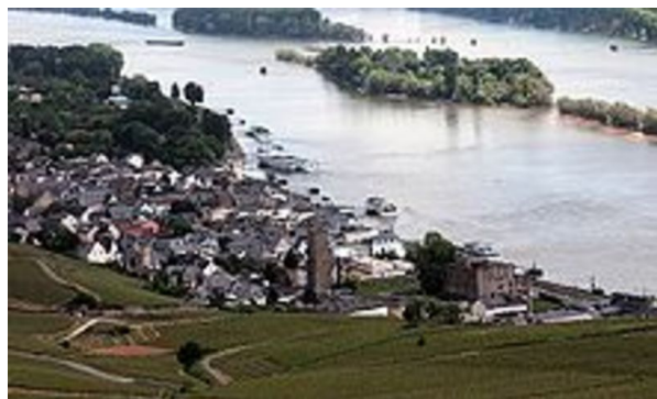
Fig. 3 - Rüdesheim am Rhein

Be that as it may, Suzuki went to England in 1936 where he delivered a set of lectures that he would publish as his famous Zen Buddhism and Its Influence on Japanese Culture in 1938 (republished in the postwar era as Zen and Japanese Culture ). Following the conclusion of his lecture tour in England, he went to Paris to conduct bibliographical research, and then on to visit some distant relatives living at the time in Rüdesheim am Rhein, a small village on the Rhine River west of Wiesbaden.