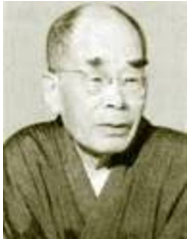
Fig. 1 - D.T. Suzuki

The always contentious, sometimes highly emotional, debate over D.T. Suzuki's relationship to Japanese fascism continues unabated. Among other things this is shown by reader reactions to a recent article in Japan Focus entitled " Zen as a Cult of Death in the Wartime Writings of D.T. Suzuki ". This debate can only intensify by the further assertion of a wartime relationship between D.T. Suzuki and the Nazis or, more precisely, a positive or sympathetic relationship between Suzuki and the Nazis. This article, in two parts, will explore that possibility though conclusive proof of such a relationship will not be included until the second part.