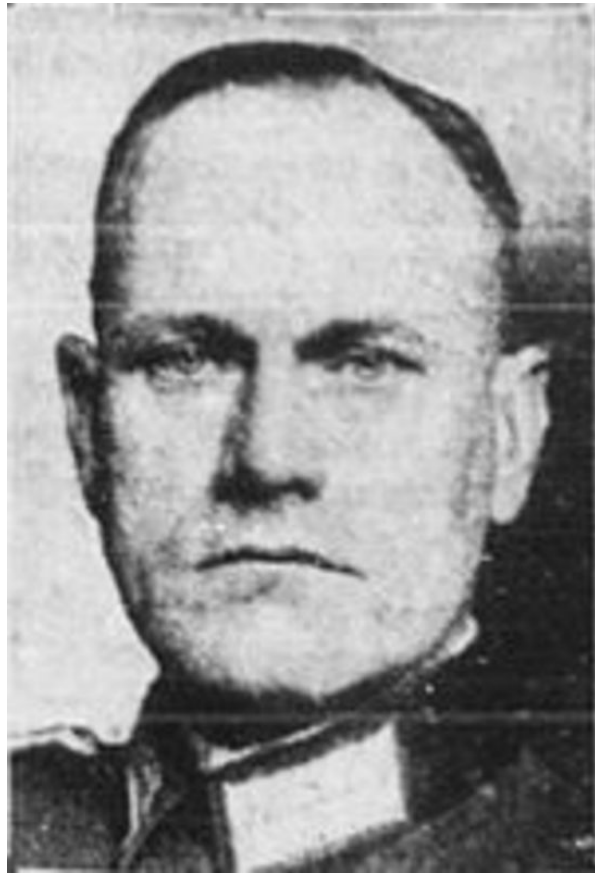
Fig. 10 - Ambassador Eugen Ott

Further, Suzuki's contact with leading Nazis was by no means limited to Dürkheim alone. On January 18, 1939 Suzuki wrote: "Went to Tokyo soon after breakfast. Called on Graf. [Graf] Dürkheim at German Embassy, met Ambassador [Eugen] Otto [Ott], and Dr. [space left blank] of German-Japanese Institute. Lunch with them at New Grand." 22 On February 4, 1943 Suzuki took part in a dinner party to honor the ambassador: "Went to Imperial Hotel to attend dinner party given to Amb. Ott and his staff," 23 and on February 16, 1943 Suzuki received "a box of fruits in recognition of my presence at a dinner party in honor of Amb. Ott of Germany." 24