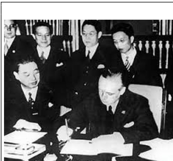
Fig. 7 - Signing of Anti-Comintern Pact

In short, the societal context within which a piece is written, coupled with the writer's personal background, are important and often neglected methods for determining the meaning of a text. In Suzuki's case, the question is not only the meaning he himself meant to convey, but also, what the editors of a major Buddhist newspaper would have allowed him to say in October 1936. As Sueki Fumihiko, one of Japan's leading historians of modern Japanese Buddhism, points out: "When we frankly accept Suzuki's words at face value, we must also consider how, in the midst of the situation as it was then, his words would have been understood." 6 In other words, what would Suzuki's readers have thought he meant?