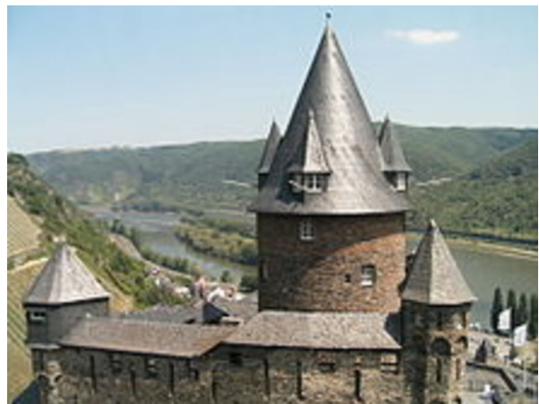
Fig. 6 - Stahleck Castle

Setting aside the question of Communism's ideology, the people at its core are intellectuals who have never been intimately connected with the land. Furthermore, their ideology is something that has been directly imported from abroad and has no roots in the history of that country. Taking their claims to be absolute, they butcher those who oppose them without hesitation. This is something that others and I can in no way approve. While it is true that Nazis and Fascists also insist on totalitarianism, in one sense it can be said that theirs is a form of resistance to Communist actions. Or it can also be understood as turning the Communists' methods to their own advantage.