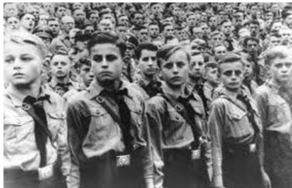
Fig. 5 - Hitlerjugend

no good, one of the great missions of the German people is to crush Soviet Russia. The speeches given by the leaders at the recent Nazi rally in Nuremburg, among others, were very extreme. They directly attacked the Soviet Union as their great enemy of the moment. They said as much as could be said in words, completely ignoring diplomatic niceties and attacking them viciously. From looking at the newspapers, you can get a good sense of their truly fierce determination. People are saying that if, in the past, the leaders of one country had done something like this it is inevitable that within twenty-four hours the other country would have declared war. In any event, the Nazis' determination is deadly serious!