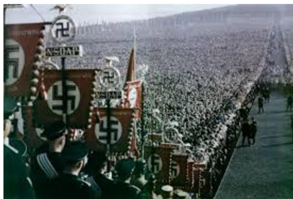
Fig. 4 - 1936 Nazi Rally in Nuremburg

On occasion, in England, too, I have encountered Jews. I recently met a young self-professed wealthy poet who had been persecuted and expelled from Germany. After listening to his story, I felt sorry for him because he suddenly found himself living in poverty in a foreign land. As regards individuals, this is truly a regrettable situation.