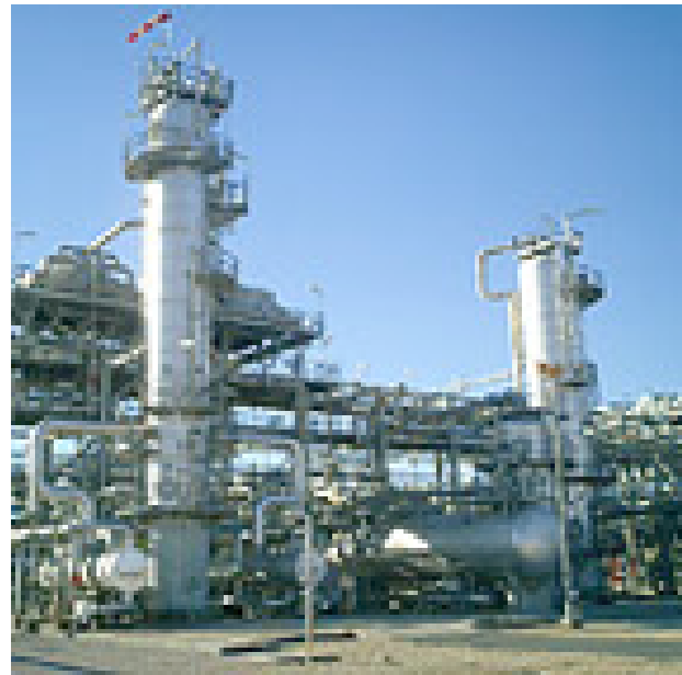
Teikoku Oil's gas project in Algeria

the West Bakr and Southeast July blocks. Teikoku Oil also made inroads into the Algerian oil and gas sectors several years ago. It is participating in development projects in Ohanet and El Ouar I and II blocks. Teikoku Oil has also participated in an offshore oil development project in the Democratic Republic of Congo since the 1970s.