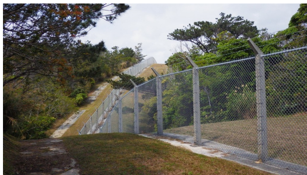
High fence surrounding storage area (2014 photograph)

Meanwhile, after-effects of the base persist. Three Army veterans of the 137th from the