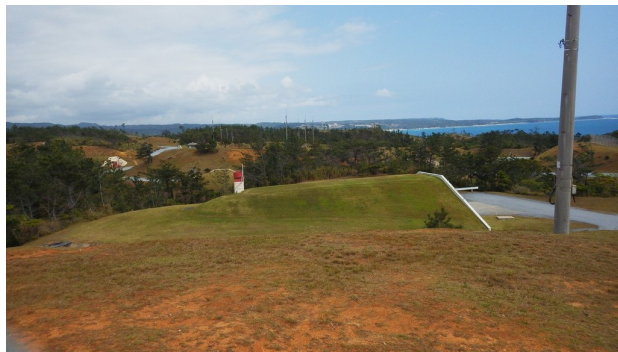
Storage area with fortified underground igloos that contained nuclear weapons before reversion (2014 photograph)

government paid for the removal of nuclear weapons from Okinawa are the first and only time the U.S. government has acknowledged their presence. 4 Since they were removed, the Marines have used the base to store conventional (non-nuclear) ammunition. However, the nuclear weapons storage area remains intact to this day with close-cropped grass and sod-covered concrete storage igloos with steel doors.