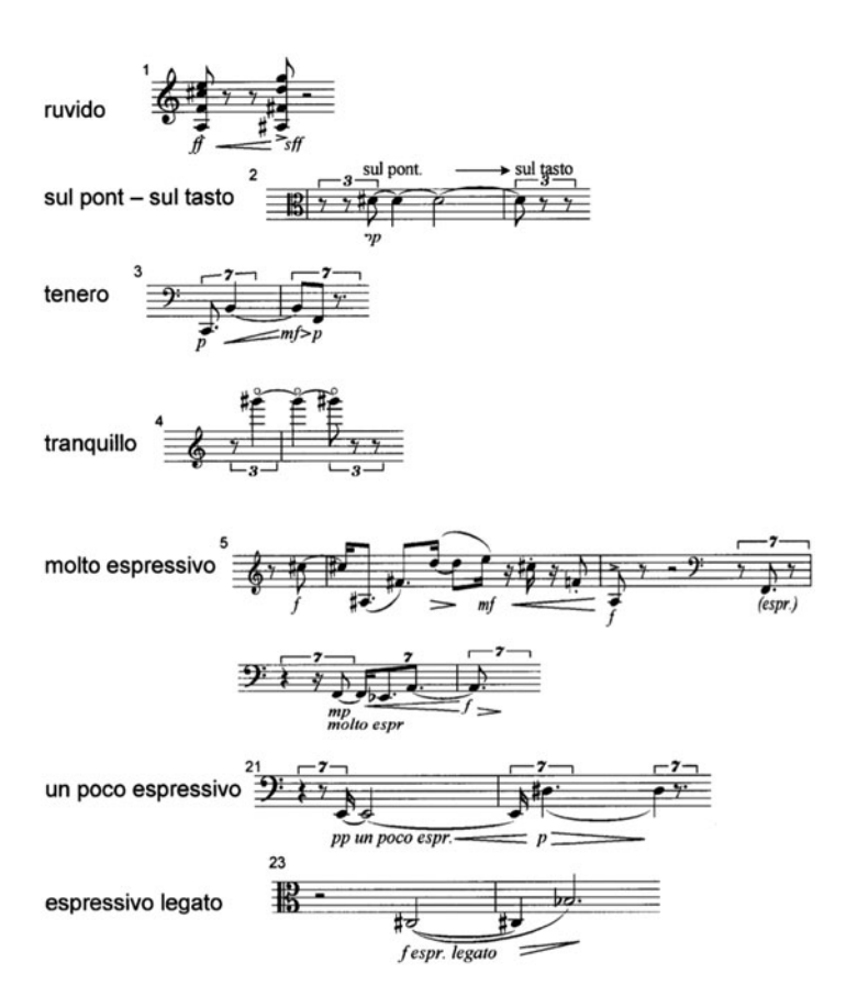
Example 3: Yeon-Su Kim's 'character table'.