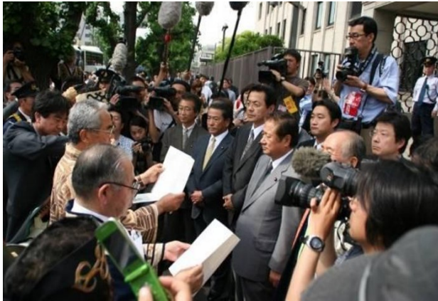
The chairman and directors of the Hokkaido Utari Kyōkai present demands to Hokkaido politicians during a demonstration on 22nd May 2008

The Japanese government's position has, until now, been unwavering. Even in the earlier report of policy suggestions made by the Council of Experts on Implementation of Countermeasures for the Ainu People ( Utari taisaku no arikata ni kansuru yūshikisha kondankai ), submitted in April 1996, and which led to the formation of the Ainu Cultural Promotion Act, it was said to be "impossible to put the right of self-determination which relates to a decision of political status, such as separation/independence from our country, or to the compensation/restoration of resources and land in Hokkaido, into the basis of the implementation of new measures for the Ainu people" 14 . Ever since the submission of this report, this has remained, and has been quoted, as the government's official position. Now, however, it would seem that the provisions made in Article 46 of the UN Declaration have inexorably ensured the state's final decision as to what might constitute a "partial imparity" to its "political unity". Japan's state machinery is now able to recognize the Ainu as indigenous on their own terms.