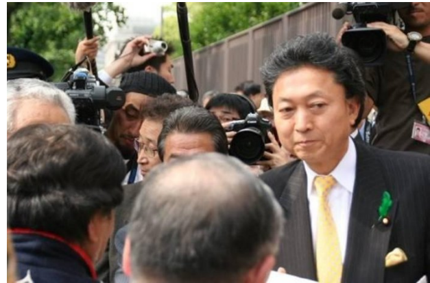
Suzuki Muneo in Ainu garb and Hatoyama Yukio greeting marchers during the May demonstration, a month prior to indigenous recognition.

In spite of the packaging, at base, however, there has been very little difference between the structure of these recent developments and those which led to the creation of the Ainu Cultural Promotion Act more than ten years ago 24 . The political meanderings that set the stage for the drafting of that Act took place during the 1990s realignment of Japanese politics, in which the LDP lost power for the first time in the postwar era. It was drafted and legislated during the switch between the Japan Socialist Party-led Murayama Cabinet and the newly revamped LDP government of Hashimoto Ryūtarō. Indeed, it is possible to group the Ainu Cultural Promotion Act together with a number of other flawed initiatives – or political full-stops – that the Murayama government introduced to try and put an end to the so-called “1955-system” of LDP-led politics. These would have to include the Atomic Bomb Survivors Assistance Act of 1994 and the Asian Women's Fund set up in 1995 for former “Comfort Women” which excluded the possibility of direct state compensation, but were hyped as important moves on issues that had been left dormant by previous consecutive LDP governments 25 . In actual fact, what these policies finally achieved was to clear the way of both social and postcolonial baggage for what