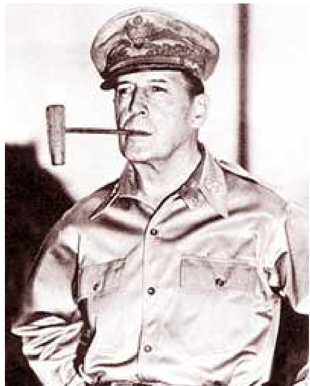
Gen. Douglas MacArthur

There was yet another reason. Weller had been MacArthur's nemesis ever since the correspondent escaped from Singapore and Java to Australia in early 1942, and came under the iron hand of censorship while reporting the struggle up the Pacific islands. The general would have taken Weller's entry into Nagasaki as a personal affront as much as a defiance of his authority.