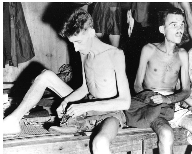
Released POWs at Aomori, Japan, 29-30 Aug. '45