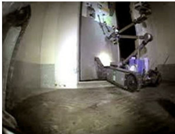
Packman: A PackBot, U.S.-made remote-controlled machine, opens a door to the main reactor building of unit 2 at the Fukushima No. 1 nuclear plant on April 18.

On March 17, six days after the crisis erupted at the Fukushima No. 1 nuclear power plant, a list was presented to Washington through diplomatic channels seeking U.S. assistance.