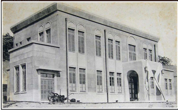
The main administration building at Nagashima Aiseien, a symbol of the modernity of public health as nation-building.