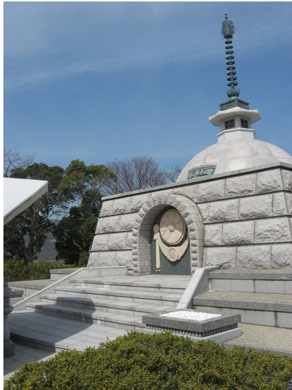
Banreizan, the collective mausoleum at Nagashima Aiseien, following its post-lawsuit renovation.