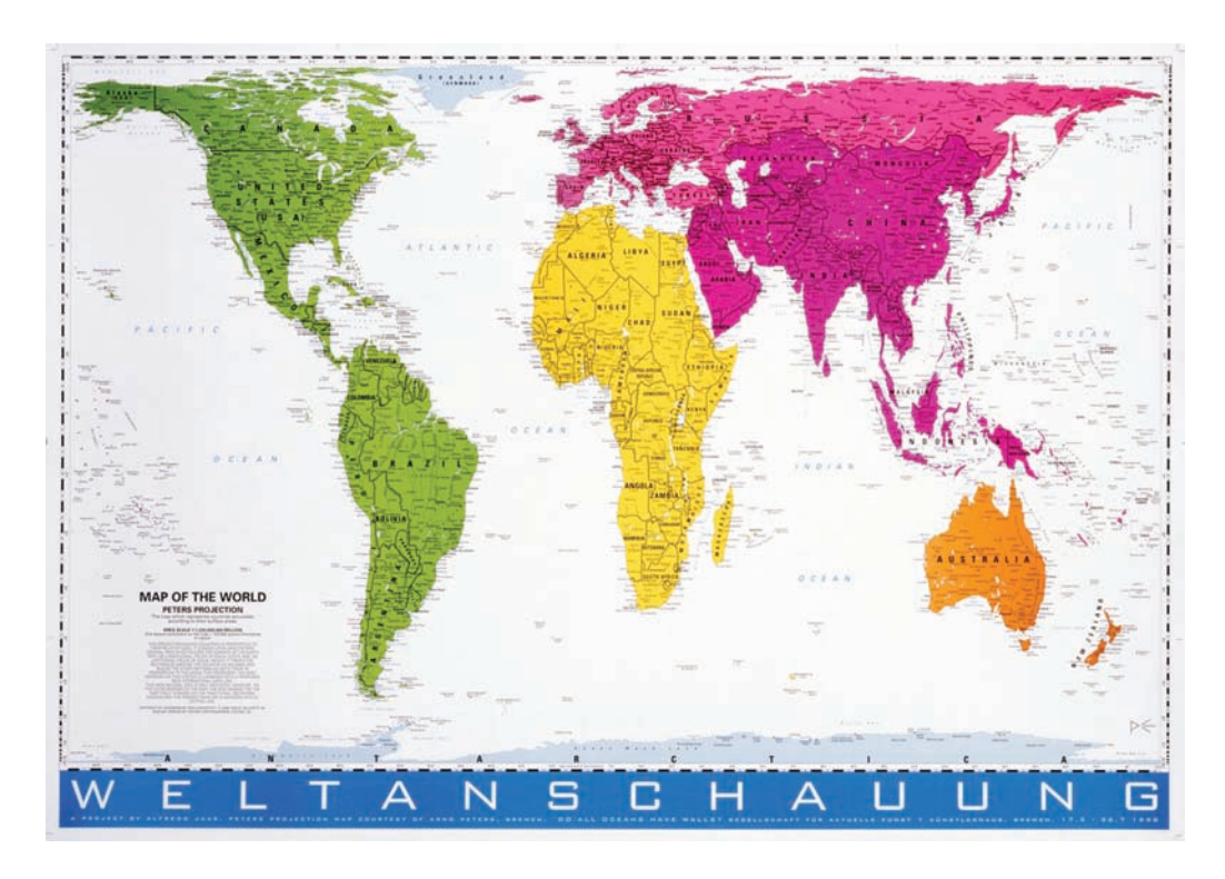
Figure 1. Alfredo Jaar, Weltanschauung, 1988, © Courtesy of the Artist.

of old masterworks. The history of "errors" and "misunderstandings" in the perception of a work through its past was taken as a dimension that would actually contribute to the meaning of a work of art, adding layers in an open process of interpretation. Today, the challenge of the contemporary viewer's historical distance from the "original" function of an image in a church, say, has certainly not lost its urgency; however, we accept the variety of possible references.