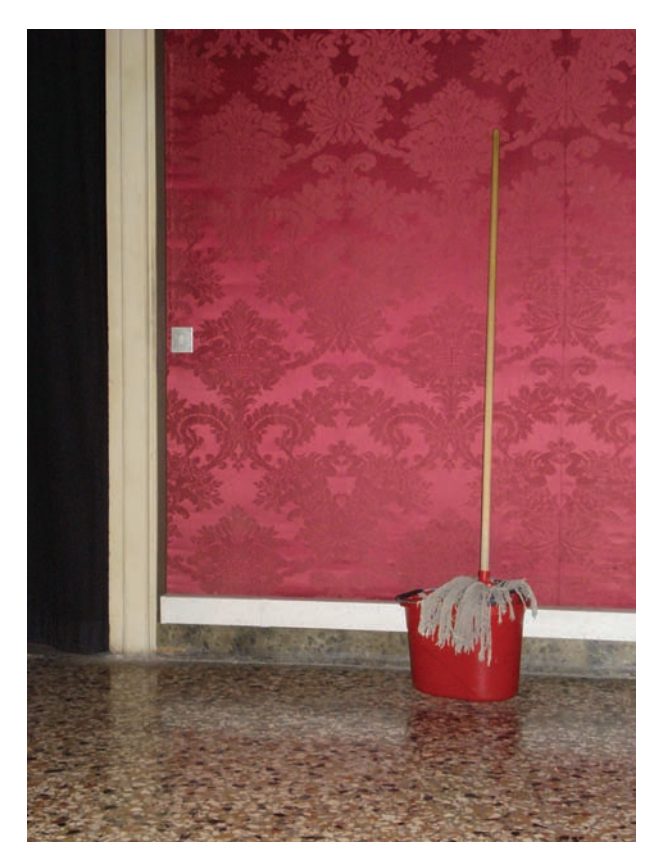
Figure 3. Teresa Margolles, ¿De qué otra cosa podríamos hablar?, Biennale Venice, Mexican Pavilion, 2009, © Courtesy of the Artist.

notion of universalism with his innovation of five platforms all over the world, which were set up for the discussion of issues related to globalism, difference and identity. Enwezor's act of decentralisation illustrates the fact that there are always places and discourses going on that we cannot participate in. We are used to talking about places, imagined and constructed, that we will never be able to visit. Thus, the geographical reference system has become a fictional one, serving the need for a cultural pluralism that, in the economic system and even in the globalised art market, seems to be under pressure. Although Ilya Kabakov has lived in America for many years, his reference system still remains the Soviet Union. In works like Dans la Cuisine Communautaire , he evokes cultural issues of everyday Soviet and post Soviet Russian life. We perceive his art as Russian and even use it to complete our imagination of that distant country. Olafur Elliasson, born in Denmark, lives and works in Berlin yet his reference system is Iceland. These examples show that the spatial and cultural dynamics do not mean that the reference to a geographic space has become irrelevant. On the contrary, it develops its narrative quality to exist at a level that involves imagination and clichés as a productive power that is more than just "right" or "wrong".