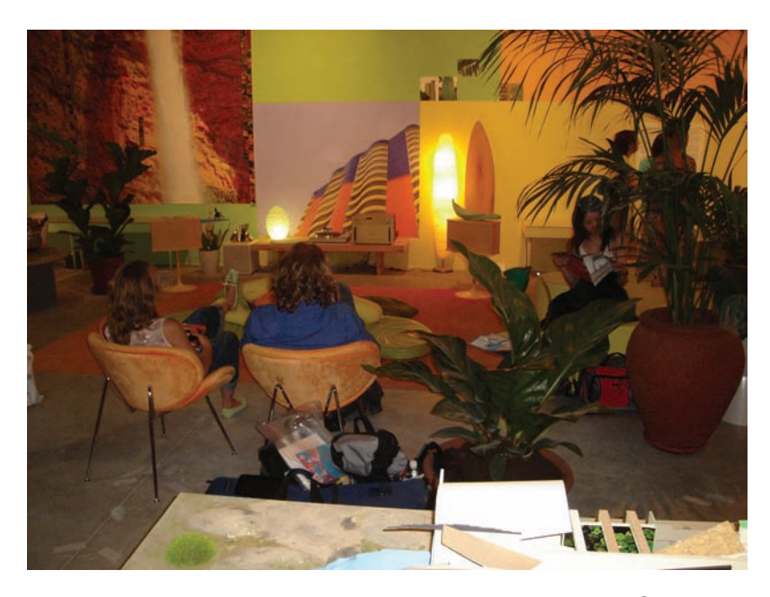
Figure 2. Sergio Vega, Paradise in the New World, Biennale Venice, Arsenale, 2005, © Courtesy of the Artist.

artists are included who received their training in the West – so allegedly somehow spoiling the idea of an "authentic" African or Indian art. The logic of this viewpoint is directly linked to the fatal dialectic of inside versus outside, of "us" versus "them", and to the issue of who would legitimately be able to speak, to describe and to judge (Rogoff 2000; Martin 1989; Spivak 1988). However, a closer look at this concept of location reveals that the site turns out to be very fractal.<sup>1</sup>