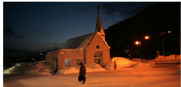
Cost cutting measures included closing the bathroom at the Yubari train station

Perhaps the best known example of a spiral of decline – but far from the only one – is Yubari, in Hokkaido, where the local government filed in 2006 for financial reconstruction, a form of municipal bankruptcy. Once a thriving coal-mining centre, the town had attempted to counter decline by spending on local tourist attractions, until it had a debt of ¥36 billion backed by annual municipal revenues of only ¥4.5 billion. The city is now cutting municipal staff by half, consolidating seven elementary schools and four high schools into two facilities, doubling fees for water and sewer services, and increasing resident taxes. These desperate measures have accelerated the outflow of people from what was already a declining population (Asahi Shimbun November 16, 2006).