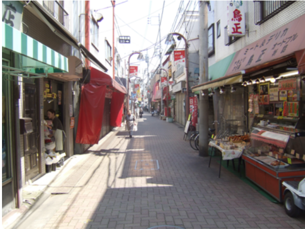
Shotengai, Arakawa, Tokyo

The second part argues that in a context of population ageing and population decline, new place-making strategies – already emerging in the more innovative settlements – are at a premium. In order to prevent self-reinforcing spirals of decline, settlements will have to attract inward migrants. It follows that one important strategy for place success is to work towards creating places that are highly desirable living and working environments. Such strategies are increasingly important elsewhere in the world, both for economic and environmental reasons, but as I show in detail in my book on Japanese urbanization and planning, quality of life and quality of local environment have historically been accorded relatively minor importance in most Japanese settlements, as priority was always put on attracting industry and jobs (Sorensen 2002). Population decline is already creating a new dynamic in local governance in Japan, in which the creation of highly livable places, with a welcoming atmosphere, quality services, and high amenity physical environments may become a significant priority. Such approaches will not emerge everywhere, and some places that attempt this won't succeed, but the context of place-making in Japan has changed greatly, in ways that put much greater priority on local quality of life than at any time during the 20th century. That change in the context of place-making may produce more space for