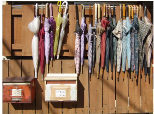
Sanya Homeless Hostel, Tokyo

have long been located in central government ministries, leaving little scope for local innovation or bottom-up entrepreneurialism, so local policy-making became increasingly oriented toward attracting central government resources, whether or not the projects or policies thus supported were actually beneficial. The situation certainly appears bleak.