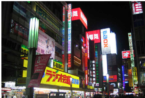
Tokyo as a magnet

population profiles, ranging from relatively younger and growing populations in some Tokyo suburbs, to very old and long-term declining populations in many regional and rural towns. There are also many special cases, like the early new towns of the 1960s such as Tama New Town in western Tokyo, where a large percentage of the population is now at retirement age, and population decline is primarily a result of children moving out.