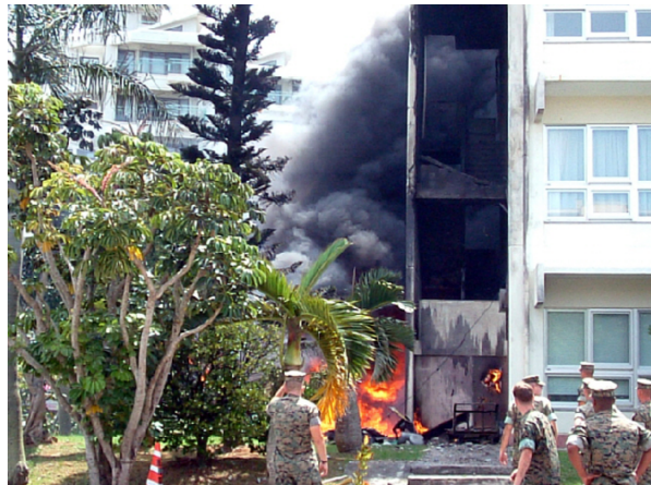
A USMC helicopter crashed into Okinawa International University campus on August 13, 2004.

US government in a very difficult position. Closing down risky Futenma as soon as possible and restoring the unstable Japan-US relationship must surely suit US national interests. If Japan adheres to the existing logic – not to mention its Chief Cabinet Secretary asking Okinawa to accept the burden of the bases – Japan will not find a solution to the Futenma problem. It deserves to be criticised for its sycophantic diplomacy following the US. Fourteen years after the agreement to return Futenma base land to the people, with absolutely no progress, the situation is ripe for change. If we link the new defense trends in the US with the 'all-Okinawa' opposition to relocation inside the prefecture, it is natural to conclude that it is time for reconsideration of the Futenma problem.