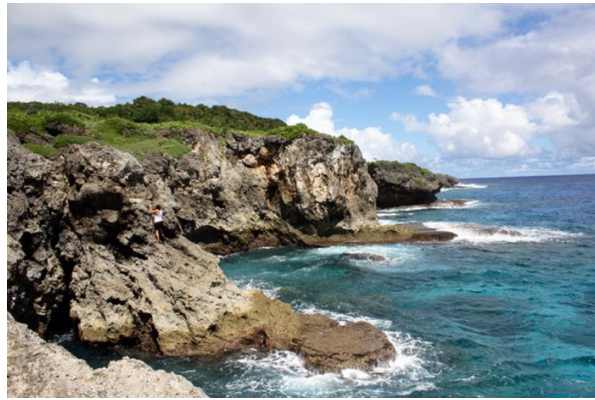
The coastal Pagat archaeological site, Guam's valuable cultural site

Prior to this, relevant congressional committees approved cutting the cost of relocation by 70 percent. With operations not progressing according to US government plan, the plan itself is now being questioned. Committee reports have severely criticised the government, stating: 'Guam's water and waste water facilities, electrical system, roads and other infrastructure are already inadequate. There is no consideration of the environment' (US Senate Appropriations Committee); 'It is a serious concern when and how the DoD will respond to the poor evaluation it received regarding the environmental impact of the Guam construction plan. They have not addressed its impact on residents either' (House Committee on Appropriations).