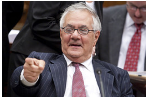
Democrat Congressman Barney Frank, frequently cites Okinawa as “prime exhibit” of what he considers “wasteful WWII legacy spending.”

In Washington, more voices are demanding cuts in military spending. In May, a non-partisan group of congressional representatives, convened by Democrat Barney Frank, and Republican Ron Paul, formed the ‘Sustainable Defense Task Force’ (SDTF). Together with some military specialists, they closely scrutinised military spending and concluded that it was possible to cut 1 trillion dollars in spending over the next 10 years by reducing US Forces stationed in Europe and Asia, and by not pursuing contracts for military airplanes such as the MV-22 Osprey.