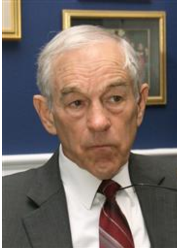
Republican Congressman Ron Paul, in an interview with Kyodo News Agency in mid-February, 2011, dismissed the view of U.S. forces in Japan serving as a deterrent, calling it an excuse to maintain U.S. military forces in the region.

In July, Frank and Paul wrote an article 'Why We Must Reduce Military Spending' for the Huffington Post , the influential political website. In it they explained that 2010 military spending was about $693 billion, over 42% of total government spending, and this is damaging the US economy and reducing people's quality of life. They also pointed out that US intervention in other countries as a superpower often generates anger directed at the US, and concluded that 'rebuilding our economy and creating jobs remains the nation's top priority. It is essential that we begin to address the issue of excessive military