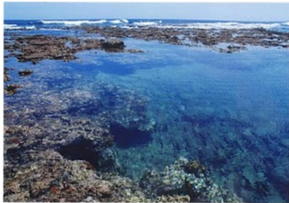
Pristine water off Henoko

As the US faces a financial crisis with no sign of recovery, and a number of difficult related issues, the trend of domestically-oriented policies and national consciousness will continue to accelerate. Even the Republican Party, which believes that a large defense budget is the barometer of state power, and which opposes defense budget cuts, has to accept that there is no such a thing as a 'sacrosanct' sector these days. If the inward-looking philosophy that 'money should be spent only on our own country' spreads further, overseas military forces will undoubtedly become a target to rationalise. Voices calling for 'abolishing overseas forces' have emerged even from within extremely conservative Tea Party groups that influenced recent midterm elections.