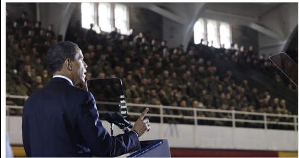
Barack Obama, announcing his decision to withdraw combat forces from Iraq at Camp Lejeune, N.C., on February 27, 2009

On August 31, President Obama delivered a speech from the White House. Because he was expected to declare the end of the Iraqi war, the entire nation focused its attention on the content to the speech. 'Operation Iraqi Freedom is over. ... We have spent over a trillion dollars on this war, often financed by borrowing from overseas. This, in turn, has short-changed investments in our own people, and contributed to record deficits.... Our most urgent task is to restore our economy, and put the millions of Americans who have lost their jobs back to work'. It marked the beginning of a new era, and under other circumstances this speech would have impressed people. The president, however looked troubled, and the atmosphere was gloomy - hardly the context for a forward-looking policy announcement; this was largely due to the severity of the economic crisis the US currently faces.