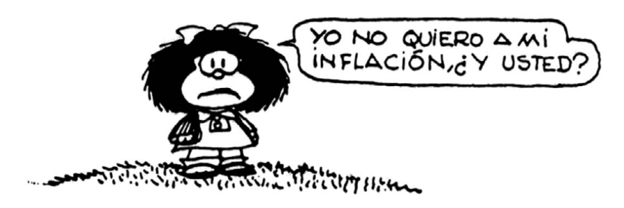
Figure 2. Mafalda comic strip.

"I don't love my inflation. Do you?" Quino, "Mafalda" (August 1971). Doaquín Salvador Lavado (Quino).