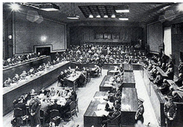
The International Military Tribunal for the Far East in session