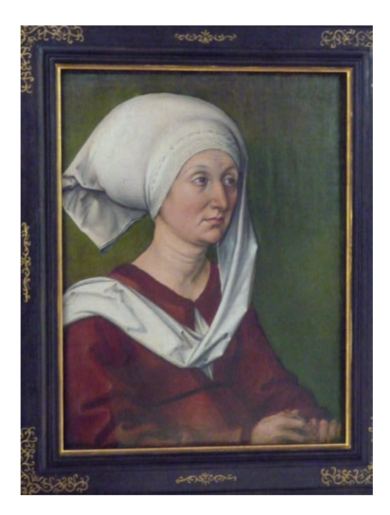
Figure 1. Nuremberg, GNM. Albrecht Duerer: His mother (ca. 1490).

CIHA congresses will be convened at venues in Asia, Africa, and Central and South America. There are already vigorous contacts with national committees in those regions, as well as many proposals for smaller annual meetings to bridge the four-year intervals between major international congresses.