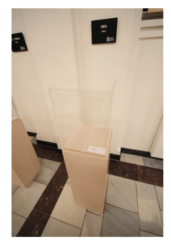
Figure 8. Ben Vautier, Rien. Schwerin, Landesmuseum, Department of Modern Art.