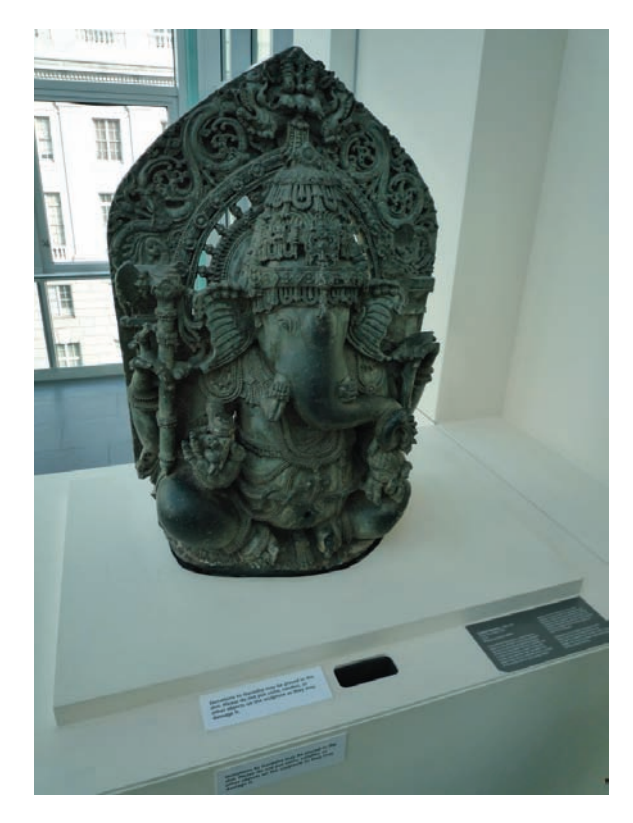
Figure 11. Ganesh. Asian sculpture with donation box. San Francisco, Asian Art Museum.

Contrasting perceptions of the art-object are even more likely to be the case when the cultural heritage of Africa, Pre-Columbian America, Asia or Oceania, are exhibited out of their original contexts. Here we are dealing with works which, for members of those cultures, may have lost none of their original sacral significance. Their presentation is likely to strike them as totally inappropriate. And misplaced, as well – namely in a Western museum – completely detached from their cultural and ritual context (Figure 11).