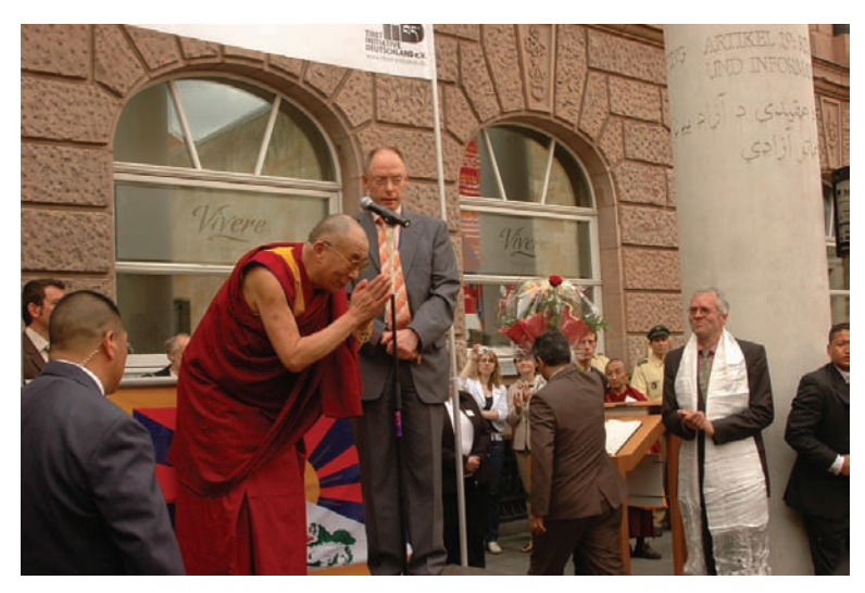
Figure 15. Nuremberg, GNM, the street of the Human Rights (Dani Karavan) and the Dalai Lama.

involvement with the object via contact with originals in the museums of Nuremberg, with their original settings and with specialists (curators, conservators, curators of monuments, artists) who are directly involved with these objects. At the same time, it will also serve to promote exchange among participants, as will the presentation of individual research results in public poster sessions and summaries of award-winning poster presentations at the Congress Center. As part of the effort to encourage international contact between post-graduate students, internal welcome and farewell gatherings are also planned.