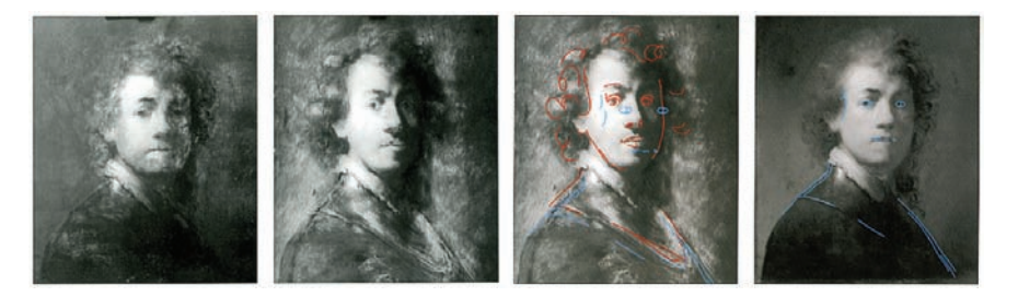
Figure 3. Rembrandt, Self-portraits.

For this reason, university research normally confines itself to dealing with the style and pictorial content of an art-work, especially in paintings, sculpture and the graphic arts, and normally refrains from dealing with matters of originality, original condition, and state of preservation of the work of art under consideration. Thus an academic dissertation may be devoted to the subject of a presumed self-portrait of Dürer and may assert hypotheses about its dating without involving any critical examination of the original portrait itself, even though museum scholars who are far more familiar with drawings by Dürer have long since eliminated that work from the œuvre of the artist. On the other hand, a museum's inventory-catalogue can undertake an in-depth 'autopsy' of a work of art without reaching any farther-reaching conclusions. To be sure, such defects – which I am simply anonymizing but not inventing – represent the extreme, but art history's problem is manifested by the absence of any widespread criticism of such shortcomings.