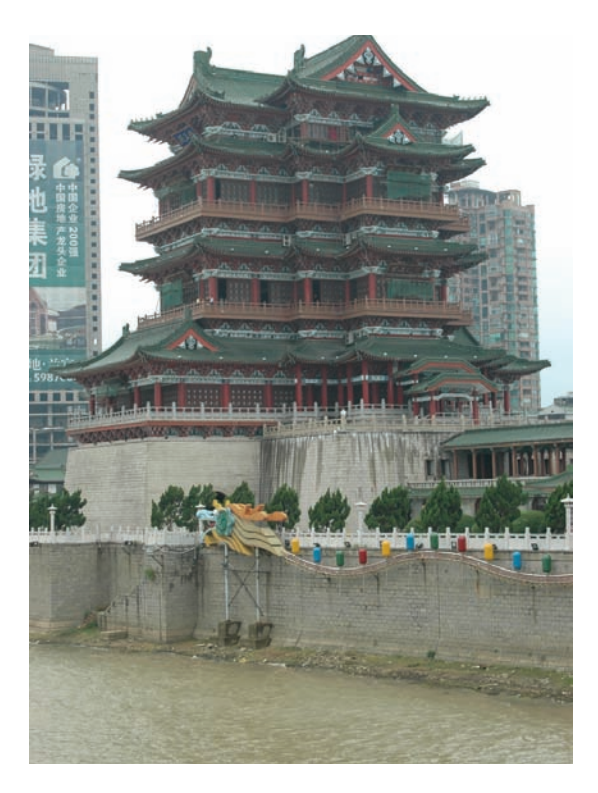
Figure 13. Nangchang (China), reconstructed medieval temple.

regular contact between central Europe and East Asia by the 13th century and that in the late 15th century there was widespread knowledge about the west coast of Africa. This is demonstrated by the 'Behaim Globe' (GNM, Nuremberg) that was produced in Nuremberg on the basis of Portuguese maps, while the first representation of the world in the form of a globe was 'made in Nuremberg' in 1492. Such contacts and interconnections need to be studied – and not only in a European context! This is a future-oriented research project, especially in view of the fact that until now non-European art history has usually been treated in Europe in separate and unrelated disciplines. At the same time, attention should also be drawn to the great achievements of non-European art. In some regards and especially during the European Middle Ages, Far Eastern art, for example, was far more highly developed – by common European standards – than the art of Europe.