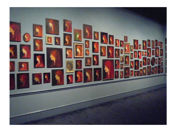
Figure 7. Francis Alys, Fabiola. An investigation. Los Angeles, LACMA, Department of Modern Art.