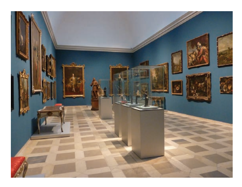
Figure 14. Nuremberg, GNM, new wing ('Galerie').

the late Middle Ages, every newly-elected king [emperor] convened his first imperial diet. Nuremberg's greatness derived from the city itself, its central location and excellent contacts throughout Europe, and in no small measure from the creative ingenuity of its citizens.