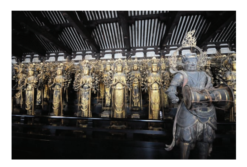
Figure 10. Kyoto (Japan), Temple.

Another section will deal with the relationship of religions to the art-object and thus also with the problem of objects of religious veneration that are extracted from their original context and moved into museums. Related to that is the question of the object as subject. The object in the