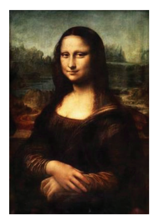
Figure 6. Mona Lisa.

The virtualization of the object stands in stark contrast to the aura of the original. What will be the effect of this 'disappearance of the object' in the 21st century? How does this phenomenon influence the history of art? How does it influence the appreciation of art by the general public? And finally, how is this aspect thematized by contemporary artists (Figures 7 and 8)? One section of the Congress will be devoted to this basic question of the concept of the 'original' both in relation to copies and reproductions and also with regard to alterations and imitations.