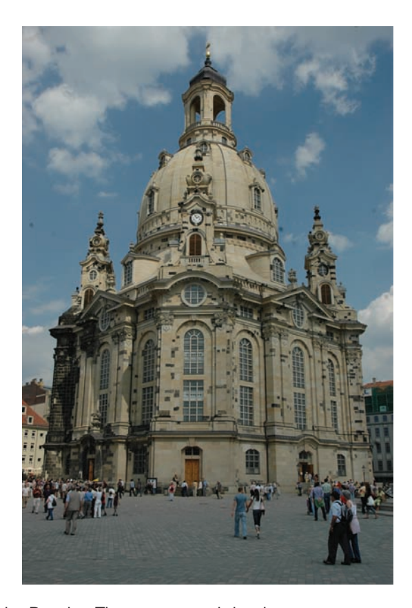
Figure 12. Frauenkirche, Dresden. The reconstructed church.

is perhaps not the rule, but it does occur quite frequently... and then, often after only a generation or two. The '15th century South Gate' in Beijing/Peking was rebuilt, along with its 'historic' intersection, 40 years after being demolished, while the historic road between this gate and the gate at the Imperial Palace is currently being torn up.