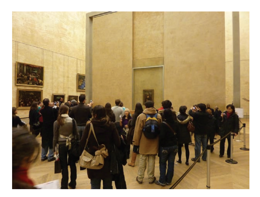
Figure 2. Paris, Louvre. Mona Lisa.

background of contemporary developments will, of course, include many 'classical' art-historical issues. The intention of the Committee on this occasion, however, is to transcend the usual categorical limitations. As a fundamental principle, no section should have a single genre, period, or continent as its topic.