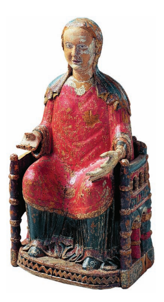
Figure 9. Nuremberg, GNM. Madonna (ca. 1200).

Bringing together the various methods and approaches is obviously a critical task. The 2012 CIHA Congress seeks to provide a fundamental starting point and basic impetus for an intensified dialogue among colleagues from every continent, nation, and discipline. The sections of the Congress will address various aspects of the topic 'object.' Fundamental issues will be the role of the art-object in art history and the way such objects are treated in relation to the methods of research and documentation. At opposite ends of the spectrum are the issues of 'The art market and the original' and 'The vanishing original in a virtual age,' particularly as a result of the Internet. The latter question, by the way, also raises the issue of rights to images of an art work.