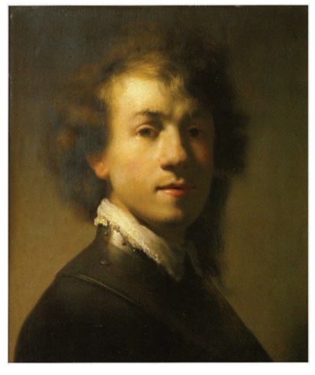
Figure 4. Rembrandt, Self-portrait (GNM).

But even in cases where the departure point for deliberations is the actual art-object, the focus is frequently not on the original – or to put it more generally, the material object – but rather on a photo of the object. It can even occur that appraisals of the originality of an artwork are occasionally prepared – even by prominent art historians – on the basis of 'excellent photographs' (Figure 4).