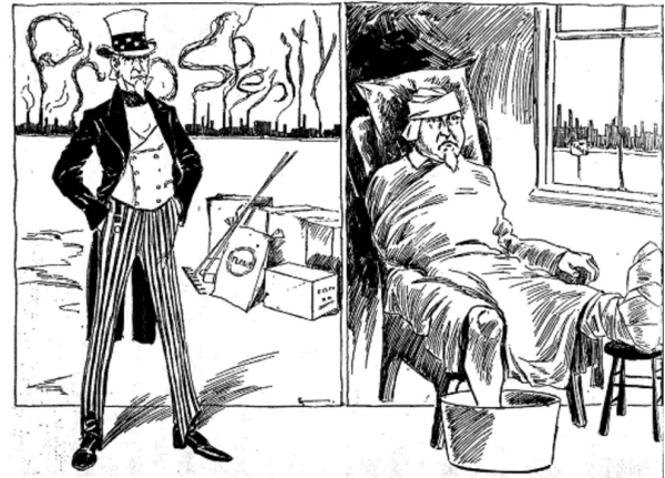
This turn-of-the-century cartoon shows Uncle Sam stricken ill and enfeebled by the pursuit of colonialism; this sequence reflects the connections that anti-colonialists made between empire and disease, which drew some to the issue of venereal disease and its impact on the U.S. military.

The broader anti-colonialist movement also turned “regulated vice” to its own purposes, although less consistently than either social purity reformers or suffragists. Anti-colonialist argumentation was as diverse as the strange political bedfellows—liberal Republicans, white supremacist Democrats, organized labor—it brought into alliance. 100 Among their other concerns, anti-colonialists condemned the impact of “militarism” on domestic republican institutions and the risk of “mongrelization” that colonialism posed to the U.S. body politic. 101 Many of these fears hinged on notions of “corruption”: the decay of republican virtue before imperial tyranny and arrogance; the sinister hands of “trusts” in promoting overseas annexation; the scams of distant “carpet-bagging” officials in the new colonies; the degradation of individual white bodies through miscegenation, and of a collective, national white body through potential colonial immigration and labor competition. As reports of high troop sickness rates cycled back to the United States, disease proved an irresistible metaphor that condensed and concretized these various forms of “corruption.” One before-and-after cartoon showed Uncle Sam prior to “his wish for expansion” in a condition of robust “Prosperity,” overlooking smoke-belching factories. In a subsequent panel representing its aftermath, he is an invalid, confined to looking out a window at closed industrial plants, ill and emasculated. 102