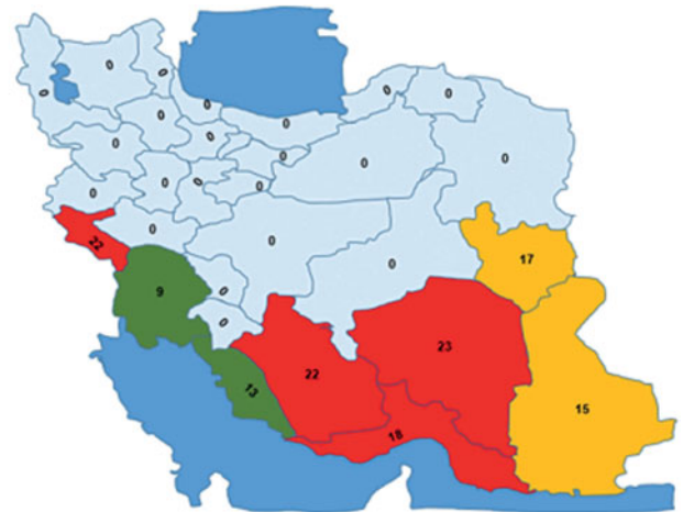
Fig. 2. Map showing the DENV Seropositivity rate in study areas in Iran, 2017.