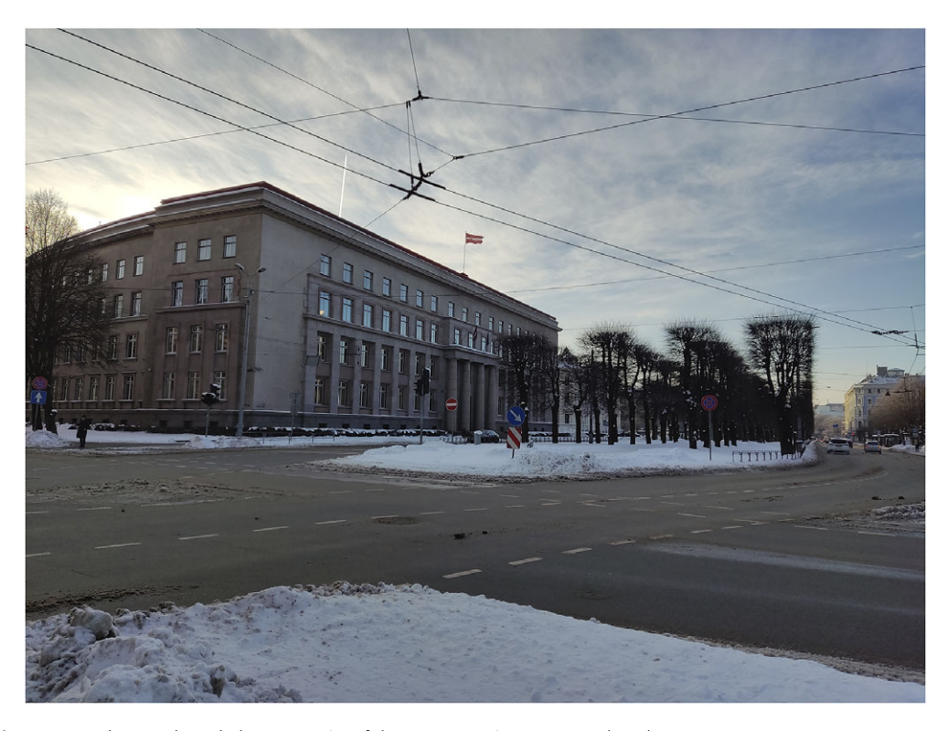
Figure 2. Freedom Boulevard, the Empty Site of the Former Lenin Monument (2021).