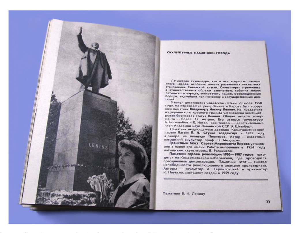
Figure 1. The Lenin Monument in Riga, the Central Symbol of the Soviet Regime (1971).

push-and-pull effect that the mnemonic remains of the removed monument can have in the context of memory production (2002–2004).