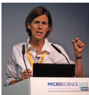
Plenary lecturer Dr. Jennifer Lippincott-Schwartz.

Dr. Jennifer Lippincott-Schwartz (NIH, US) gave the Tuesday Opening Plenary Lecture, “Seeing cells in action with photoactivatable fluorescent proteins.” It was an inspirational talk by one of the pioneers of super-resolution microscopy. After such a talk, it was fitting that Dr. Lippincott-Schwartz should be presented with the Pearse Prize, the Royal Microscopical Society’s highest award for histochemistry.