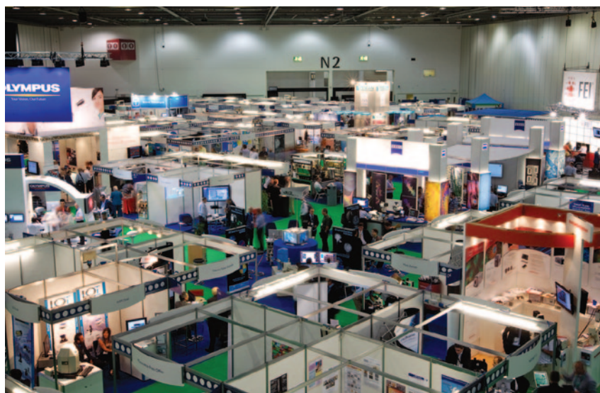
Exhibition hall at MICROSCIENCE 2010 .

The European Microscopy Congress 2012 will be held September 16–21, 2012.