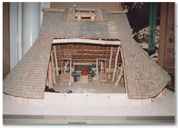
A model of a takadono, a high-roofed structure with a furnace and foot bellows (tatara), on display at Wako Museum in Shimane Prefecture.

and "kotatsu" (a foot warming device) which heat only locally those sitting nearby. People wore more clothes when cold. The other device, called "irori" (hearth) was a kind of fireplace, but it was used mainly in farmhouses. These devices may not have been as comfortable as contemporary space heating, but were very frugal in terms of energy use.