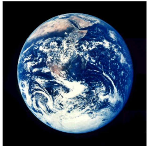
Spaceship Earth as seen from Apollo 10

Human history has recorded numerous examples in which civilizations collapsed because of overexploitation of the environment (Ponting, 1993; Diamond, 2005). Such experiences were more or less local. However, what we are now facing is a possible collapse of the spaceship Earth itself, or rather the human civilization on it. This spaceship is closed in terms of material; i.e., no significant amount of material comes in and out. The only significant input is solar energy, the only truly renewable resource available to all living creatures on the Earth.