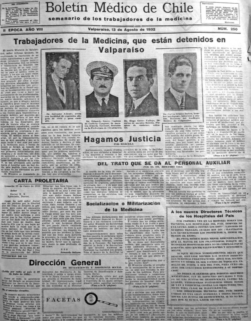
Figure 3.1 Front page of the Boletín Médico de Chile , the voice of the Vanguardia Médica, August 13, 1932. This story reports the detention of Salvador Allende (then 24 years old, at left) and other left-wing figures, including doctors and health workers, during a chaotic period known as the “Socialist Republic of Chile.”