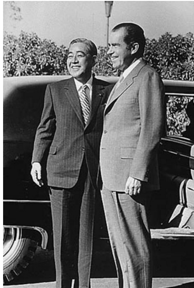
President Richard M. Nixon and Japanese Prime Minister Eisaku Sato meeting at the Western White House in San Clemente, California in January 1972. Nixon and Sato worked out the final details of the Okinawa reversion agreement during these meetings.

The two secret agreements were negotiated during the Cold War, when the United States Navy routinely transited Pacific waters with nuclear weapons onboard and the possibility of a U.S.-Soviet nuclear war was a matter of routine military planning. One of the agreements was actually a record of discussion that established an agreed and carefully defined interpretation of U.S. commitments regarding nuclear weapons, negotiated in 1960, that allowed transit of nuclear weapons through Japanese territory and waters, relegating the consultation requirement to the introduction and basing of nuclear weapons in Japan. The other was part of the 1969 agreement reverting Okinawa to Japan: U.S. nuclear weapons on Okinawa would be withdrawn but re-introduction would be possible in an emergency. Even after the end of the Cold War, which brought the worldwide withdrawal of all U.S. theater nuclear weapons, the U.S. government deferred to the Liberal Democrats on the need to keep the agreements secret, but that need is clearly now moot. Declassification is possible and necessary because determining what Tokyo and Washington actually negotiated is a question of significant historical importance and a key missing piece in the nuclear history of the Cold War.