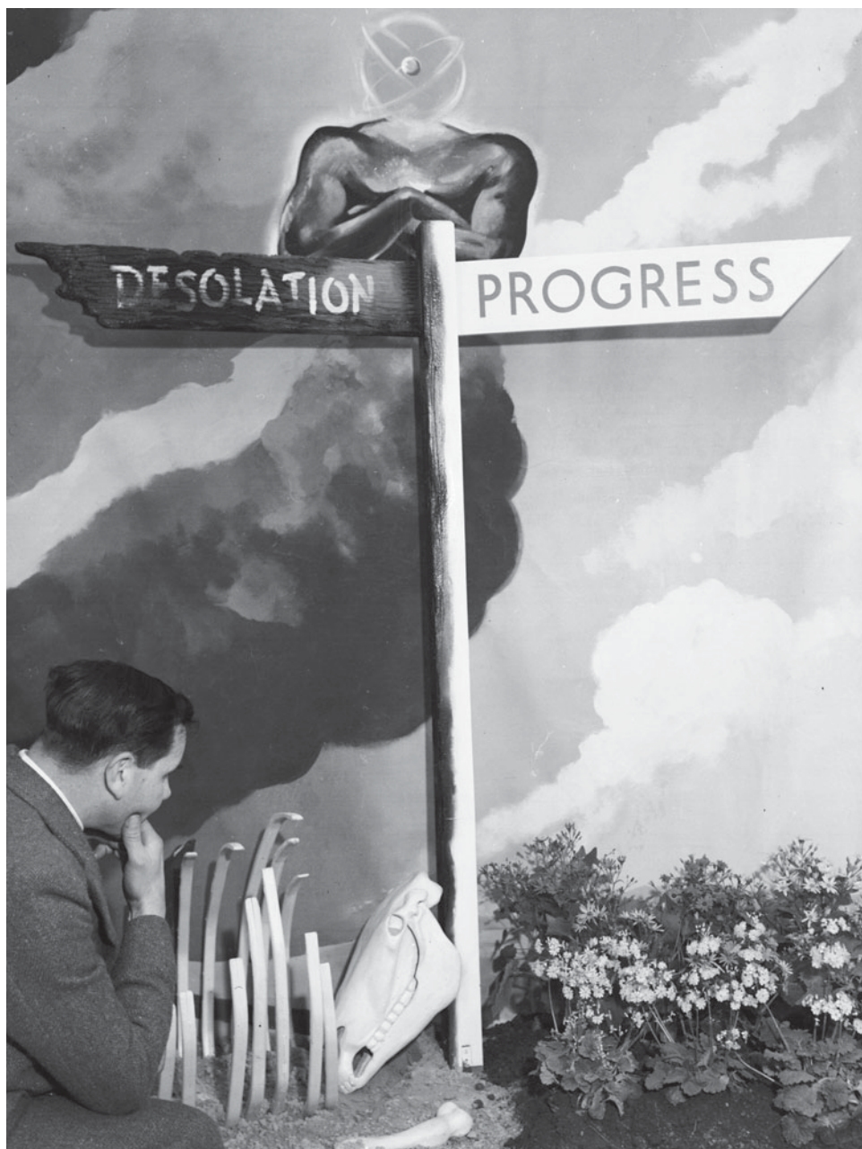
Figure 1. A flowering garden represents 'Progress' in an exhibition at Dorland Hall, London, depicting the two potential roads of atomic energy. The exhibition, part of the 'Atom Train', was the first to present atomic energy to the public and was sponsored by the British Atomic Scientists Association. 'A choice of future', 23 January 1947.