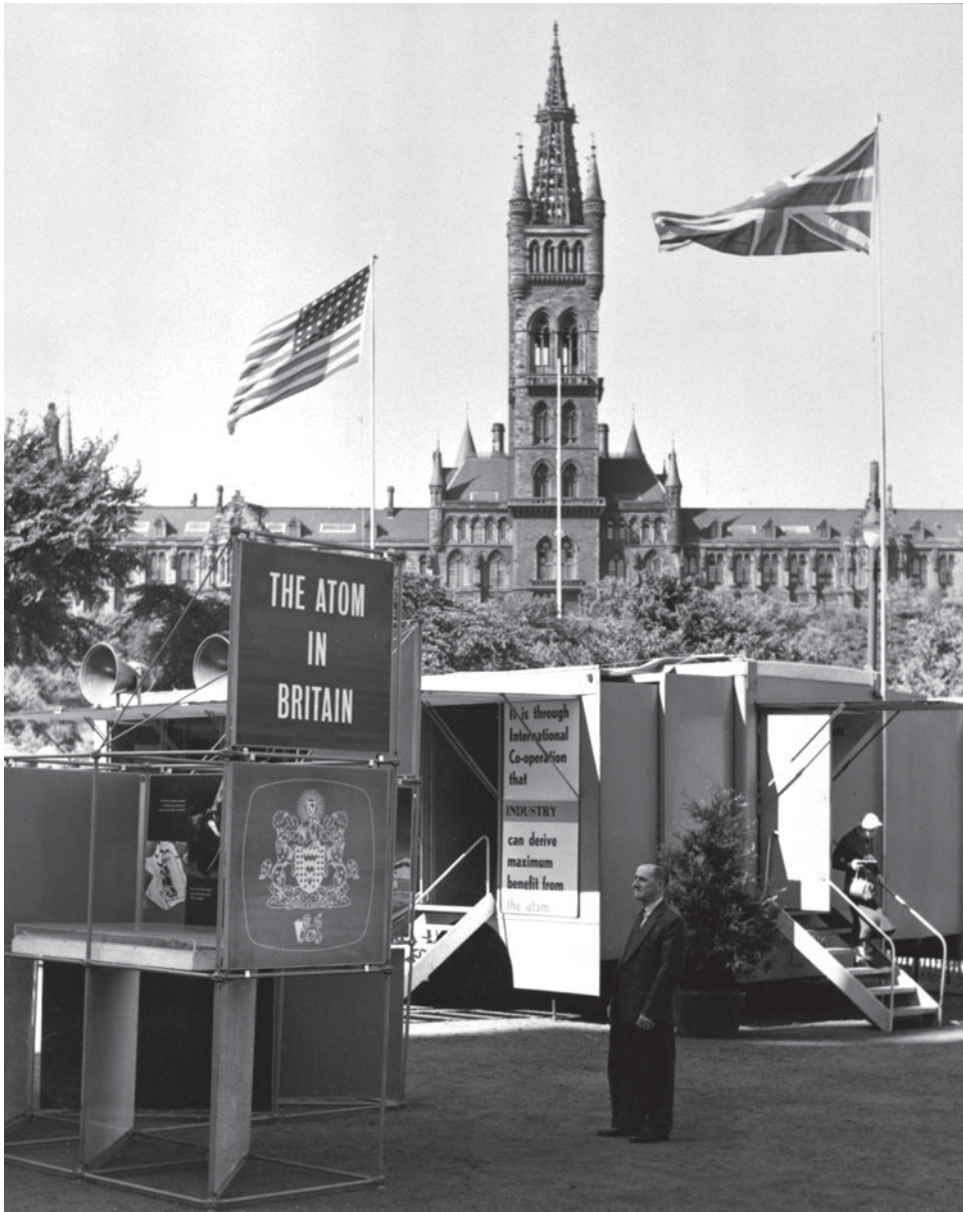
Figure 3. The Atoms for Peace bus tour visited Kelvingrove Park in Glasgow in 1955.

still able to assemble a guest list that included the American editor of Atoms for Peace Digest ; a representative of the United Kingdom Atomic Energy Authority; the man who designed the first medical accelerator cyclotron, then installed at Hammersmith Hospital; and Mr K.W. Clark from the Projects Department of the Ministry of Supply.