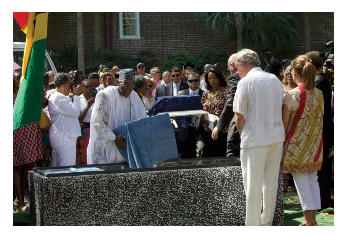
Figure 9. Community members and Ofunniyin carried the caskets for the six Ancestors and placed them in the burial vault.

by the pouring of libations, prayers, calling the names of the Ancestors, and their committal to the sacred ground in which they were laid to rest in the eighteenth century.