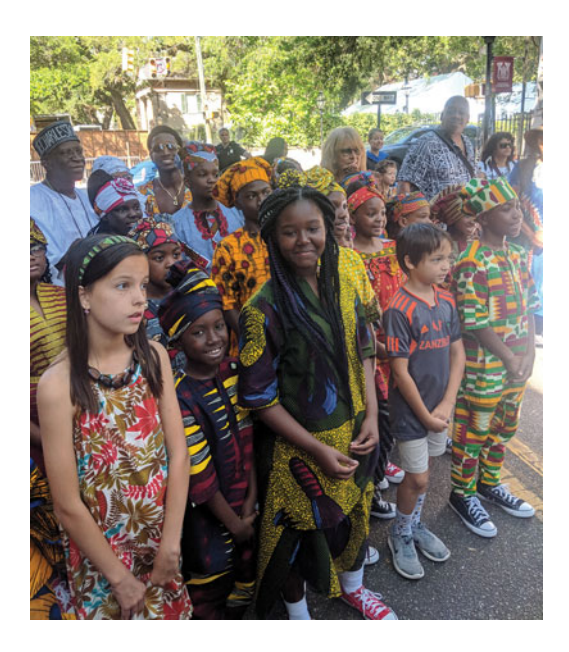
Figure 7. Children of the Watoto Academy of Meeting Street Schools followed the Oyotunji community to the reinterment site.

within 20 miles of Charlestown), which banned enslaved and free African people from gathering and playing African drums (Wood 1996).