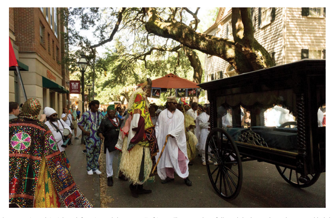
Figure 8. King Adejuyigbe Adefunmi II and the Oyotunji African Village members followed the horse-drawn hearse and led the procession to the reinterment site.

At the reinterment site, the six Ancestors wrapped in indigo were placed in a specially designed vault with the other 30 individuals, along with handwritten messages to the Ancestors composed by community members (Figure 9). Writing messages provided another opportunity for community members to connect with their Ancestors, because this act is an important part of African and Gullah Geechee traditions (Creel 1988). The enclosure of the Ancestors in the vault was followed