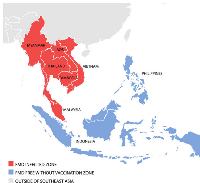
Fig. 1. Map of SEA indicating FMD disease status.

these lineages arose from a common ancestor approximately 35 years ago [4]. Viruses belonging to the O/SEA/Mya-98 lineage have been detected in all six countries of continental SEA over the past 15 years, while the O/SEA/Cam-94 lineage was only identified between 1989 and 2003 and may be considered extinct [4].