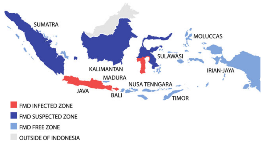
Fig. 2. Map demonstrating the progressive vaccination zones use during the Indonesian FMD eradication campaign. Adapted from Soehadji et al. [60].

possible disease carriers. Vaccination coverage was estimated to involve at least 80% of the livestock population. Vaccinated animals were identified by ear markings and there was a strict control of livestock vehicles to minimise animal movement into the vaccination area. Intensive epidemiological surveillance was performed continuously during the programme to monitor the possible reappearance of cases, and after 3 years, many regions were declared free of FMD.